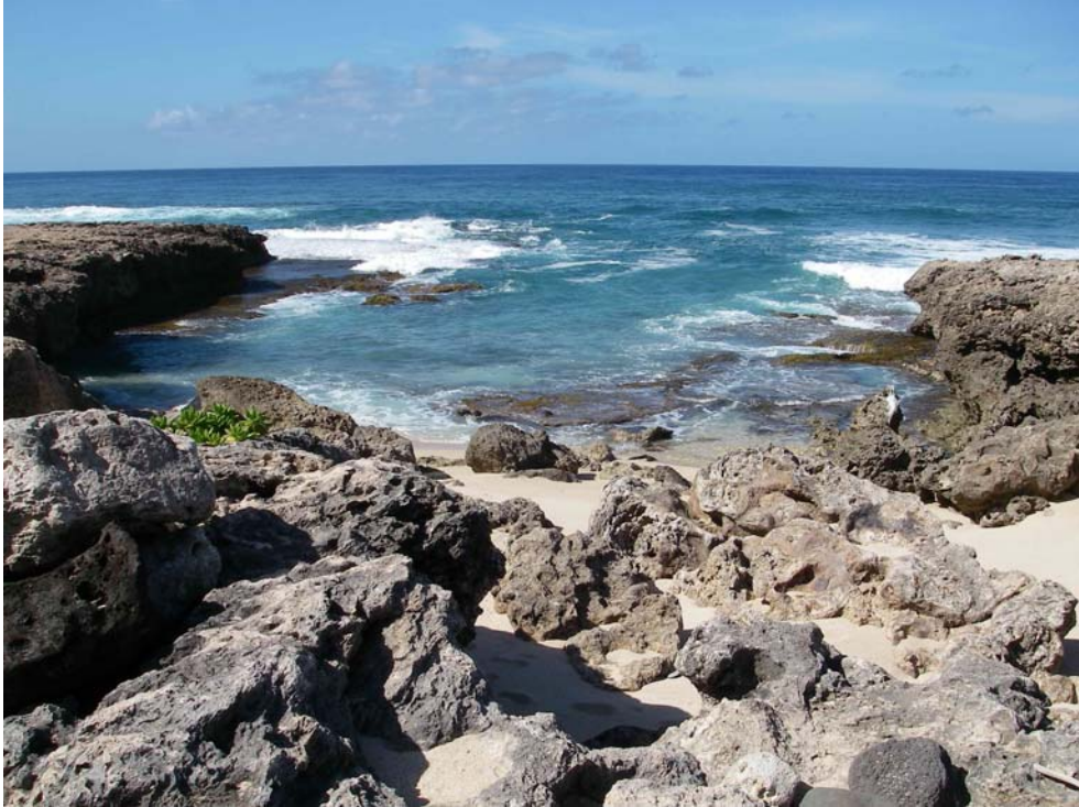
Cove and beach in proposed NAR Extension, facing north.