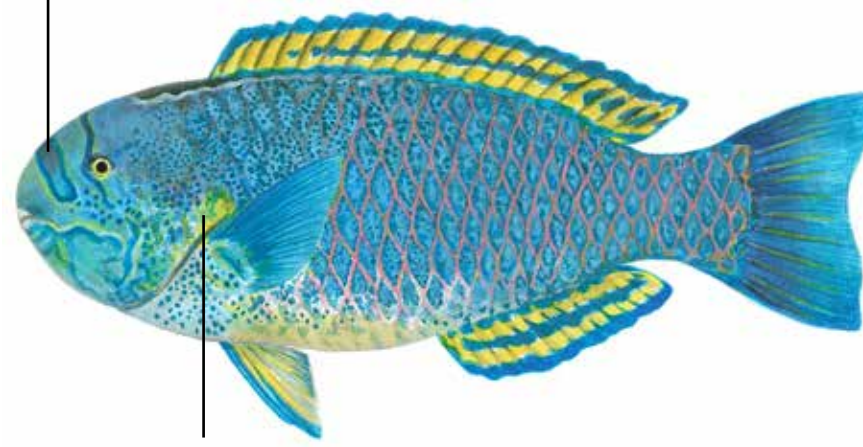
Bright yellow mark at base of pectoral fins.

Blue-green coloration with dark dots on anterior scales and pinkish edges on posterior scales. Conspicuous blue-edged lateral band in front of eyes, across top of snout.