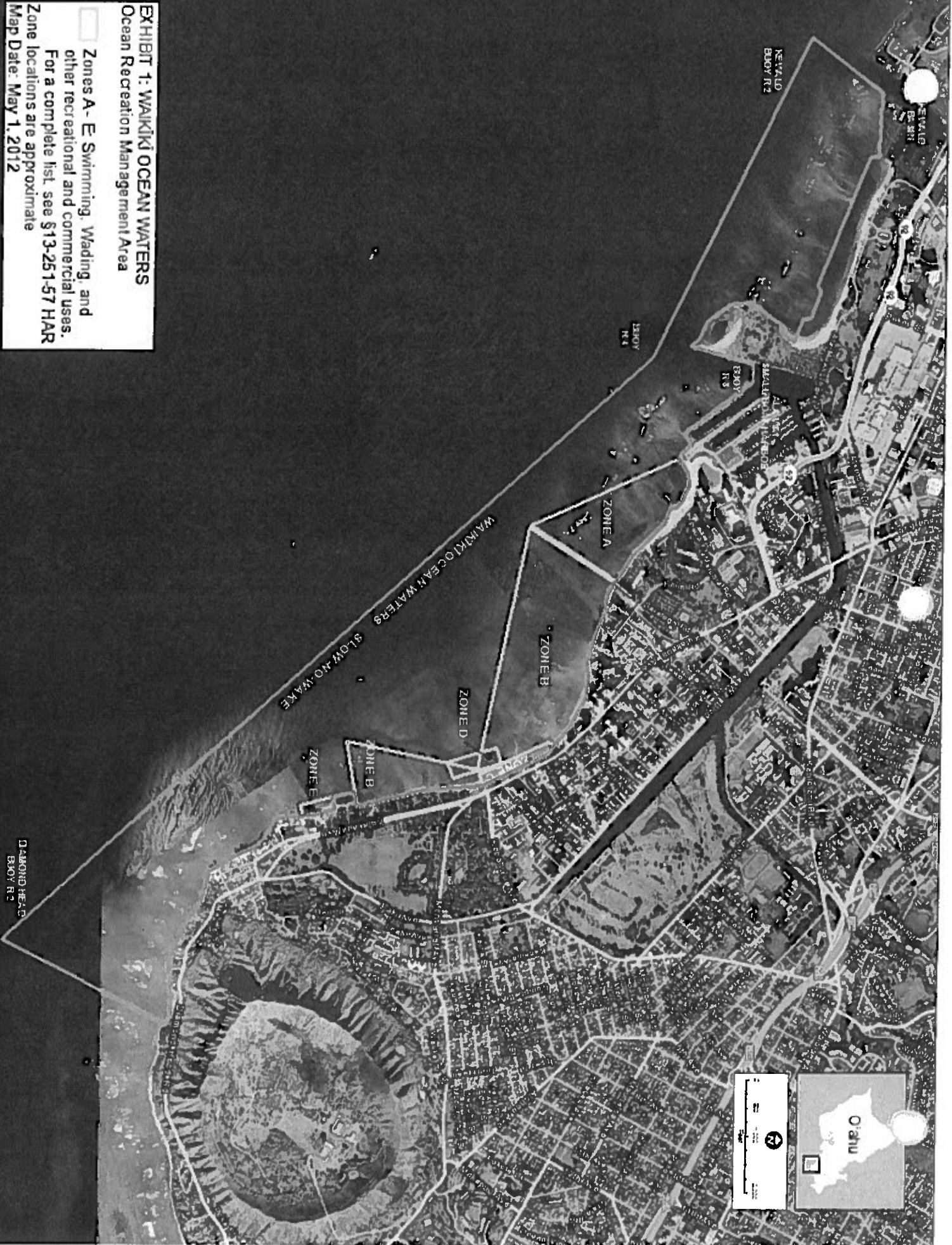
EXHIBIT 1: WAIKIKI OCEAN WATERS Ocean Recreation Management Area □ Zones A - E Swimming, Wading, and other recreational and commercial uses. For a complete list, see §13-251-57 HAR Zone locations are approximate Map Date: May 1, 2012