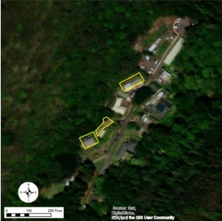
Map generated 04/06/2023. Features are approximate and subject to change.