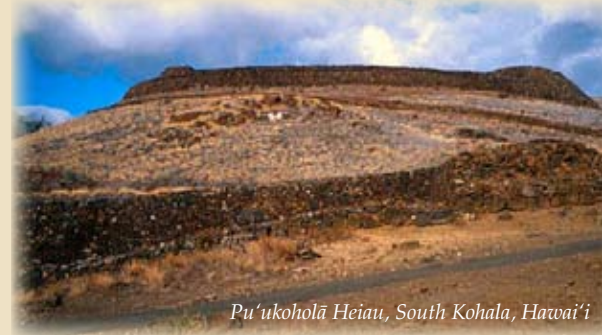
Pu'ukoholā Heiau, South Kohala, Hawai'i

We should always respect the boundaries and kapu (off limits) areas of these sacred sites. If not marked, use the outer edge of the stone or wood structure as your limit for viewing.