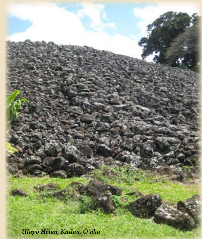
Ulupō Heiau, Kailua, O'ahu

Culturally appropriate behavior when visiting heiau , wahi pana , and sacred sites in Hawai'i