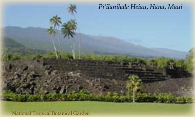
Pi'ilanihale Heiau, Hāna, Maui

God of fertility, peace, and harvest, represented by the tall, pearl-eyed ki'i . Makahiki, the annual harvest festival, is dedicated to him.