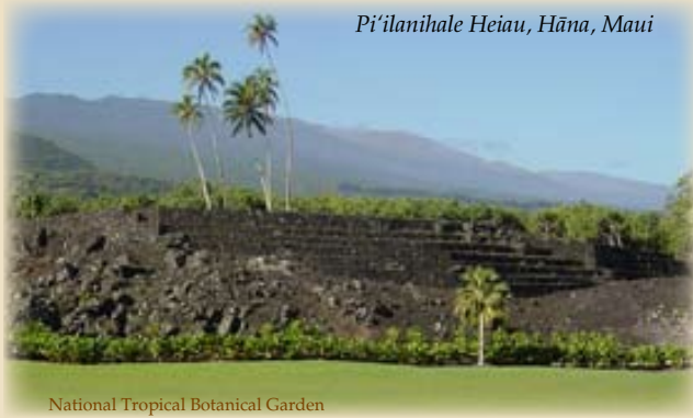
Pi'ilanihale Heiau, Hāna, Maui

God of fertility, peace, and harvest, represented by the tall, pearl-eyed ki'i . Makahiki, the annual harvest festival, is dedicated to him.