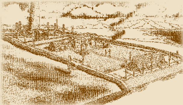
Rendering of Pu‘u O Mahuka Heiau with ceremonial structures such as the wooden ki‘i (images), lele (altars) for offerings, and thatched hale to house the ceremonial items. The heiau today with only the stone walls and interior paving remaining.

As you visit these sites today, you will see the stone foundations and walls that define the sacred area. The pole and thatch structures placed within the walls or atop the platform have long since perished.