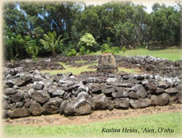
Keaīwa Heiau, 'Aiea, O'ahu