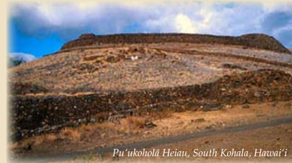
Pu'ukoholā Heiau, South Kohala, Hawai'i

We should always respect the boundaries and kapu (off limits) areas of these sacred sites. If not marked, use the outer edge of the stone or wood structure as your limit for viewing.