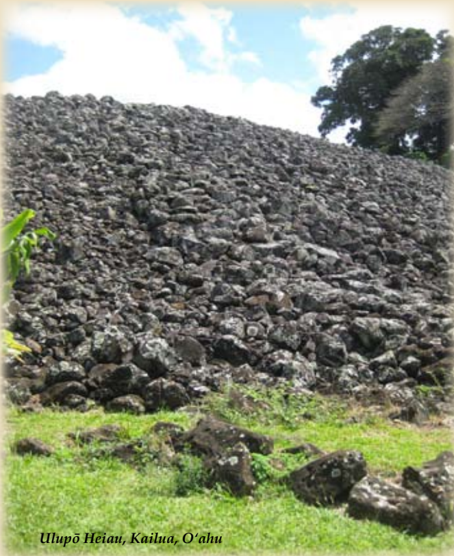
Ulupō Heiau, Kailua, O'ahu

Culturally appropriate behavior when visiting heiau, wahi pana, and sacred sites in Hawai'i