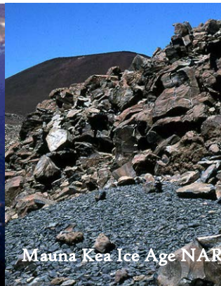
Mauna Kea Ice Age NAR