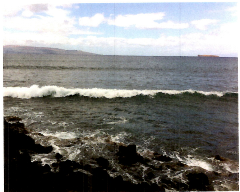
8 Ole Ku Lua ~ Keia La... Kaho'olawe (Kanaloa) ~ Molokini Island Reserves ~ Honua'ula Fisheries a Part of Ancestral Generational 'Ike Ku'una ~ Passing the Knowledge to my Mo'opuna....