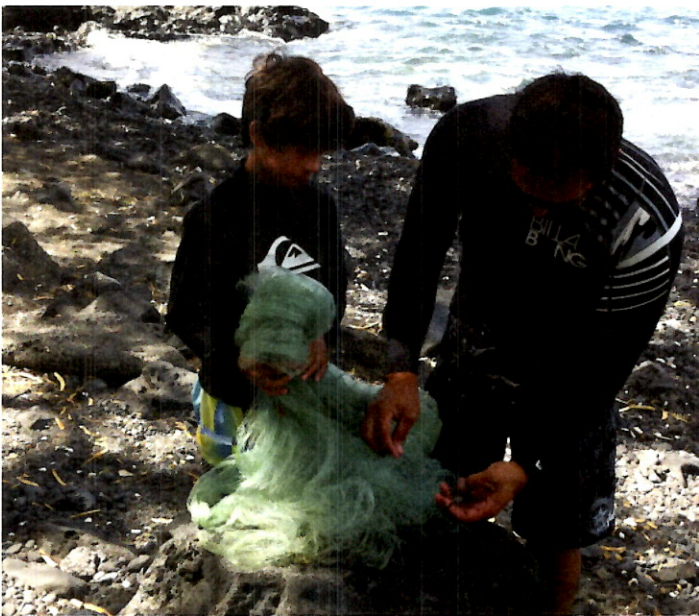
3 Upena ma'a