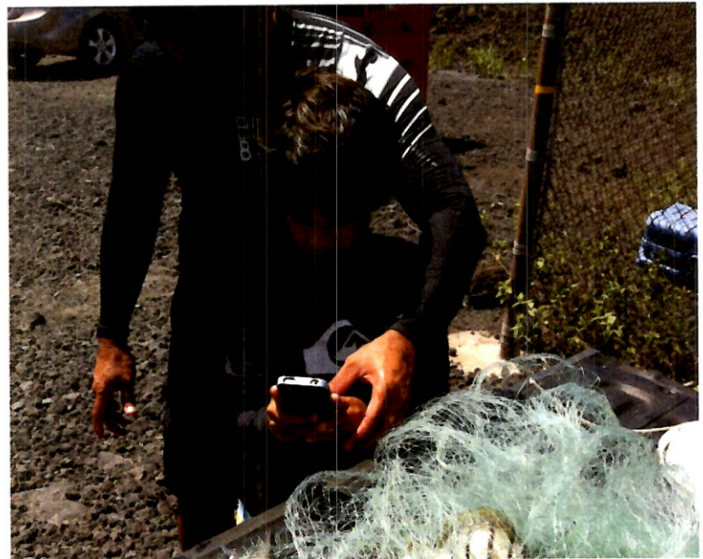
12 Papa and I... Ensnare (Hei-au)... Embraces the Abundances and Family Konohiki ~ Moku Kuleana ~ 'Ala O Honua'ula na mea ai ola.. O ke kai... Aloha ke Akua.. E Na Aumakua...