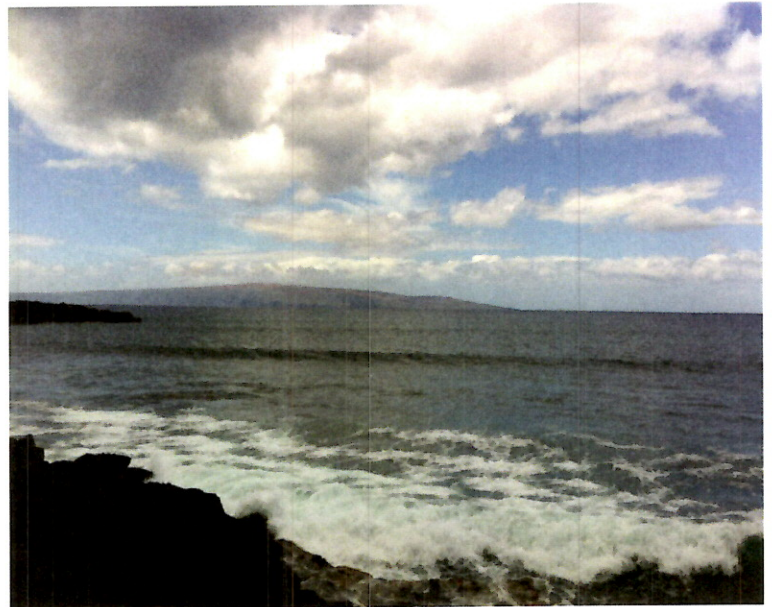
6 Na Kai Ho'omalulu... Shadows over shadows... I can see the Darkest Blacks....