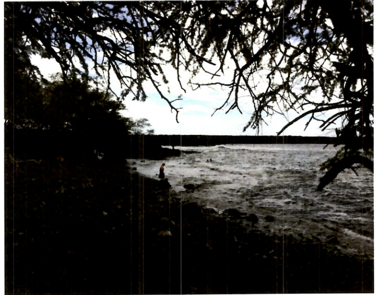
10 Along the Kanahena Coastline.... 10:30 am... Overcast... Partly Cloudy... Kona Winds....