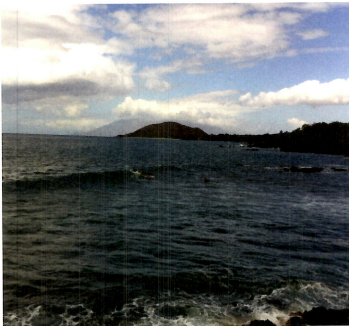
7 Pu'u o La'i... One Loa... Pu'u Kukui... Northwest Background from Kanahena Reserve... Surfers and Snorkelers in the Area