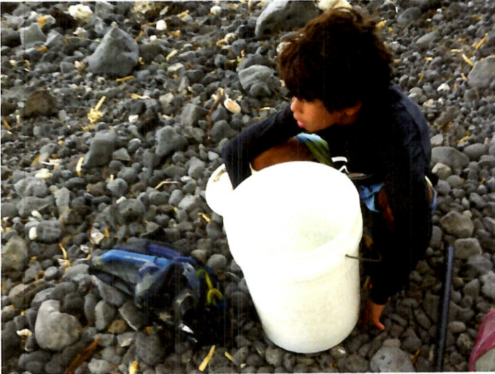
9 Taking a break... A Day with Papa and Grandpa...!