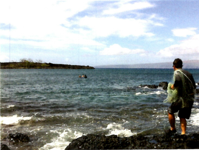
5 Kekoa ~ Aekai ~ Wai Ha'a ~ Mamau, Ka Lae Mamane, Kahao'olawe background