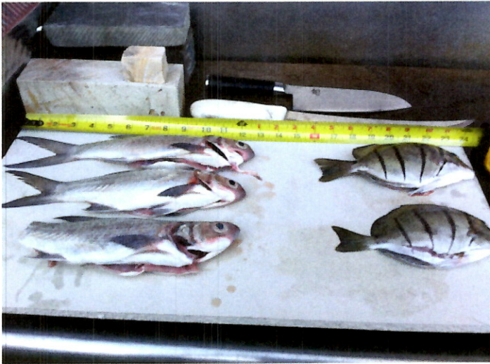
13 Na Lima o Kuloloi'a... Nui... Miki... Loa... Pili... Iki... Manamana Lima.... Ho'okaulike... Lima Akua