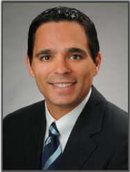
JESSE SOUKI DBEDT

PROVIDING STATE POLICY DIRECTION, COORDINATION, AND PLANNING TO PROTECT HAWAI'I FROM THE IMPACTS OF INVASIVE SPECIES.