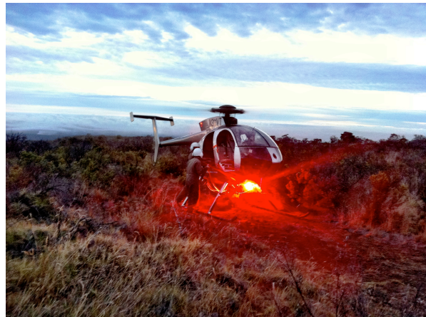
Seen in this photo the Axis Deer Team preparing for an early morning FLIR Aerial Survey

[Deliverable 3]: Outreach activities targeted to increase frequency and reliability of axis deer sightings on the Big Island.