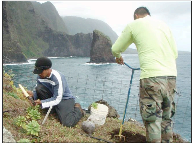
MoMISC staff: weed control and restorative planting at Kalaupapa National Park, Moloka'i

Number of acres surveyed and acres treated: A total of 38,978 acres were surveyed for invasive plants; 7.6 acres treated. Staff also conducted surveys for little fire ant on Maui (108 sites) and Moloka'i (419 acres) and veiled chameleons on Maui (22 sites) with no detections.