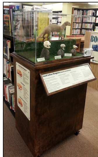
Mongoose Display at the Kapaa Public Library