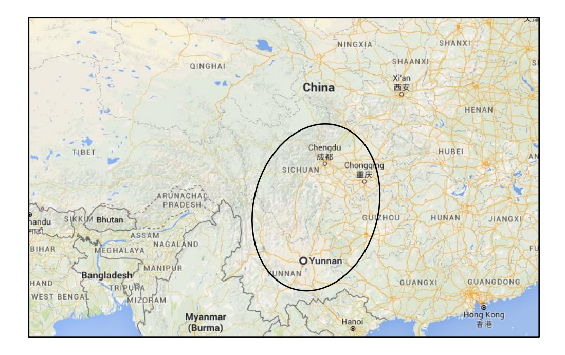
Figure 3: Geographic region surveyed in China in 2014

Specimens of field collected arthropod and fungal natural enemies, as well as leaf material of selected R. ellipticus and R. niveus populations were deposited at PPI. Figure 3 shows the regions covered during the surveys.