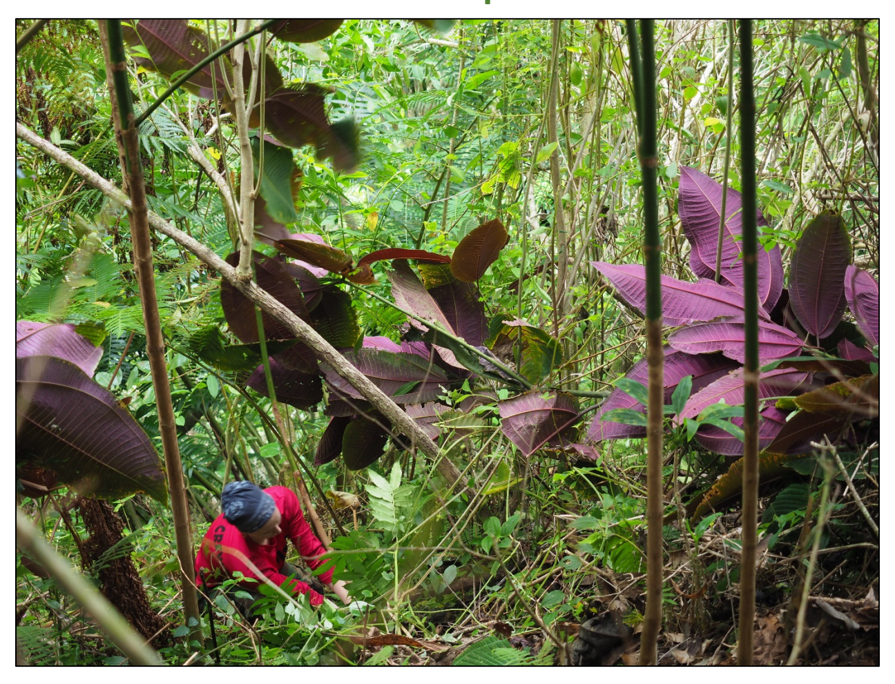
OISC crewmember removing miconia from Maunawili