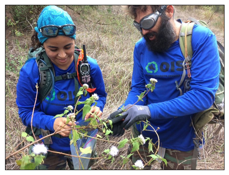
Removing reproductive parts of devil weed (Chromolaena odorata).

at Camp Smith are on hold due to a signficant amount of range debris that discovered by the OISC crew. A member of the public reported a mature plant in Makaha Valley in December. OISC is planning on conducting surveys and assessing the scope of the population there in 2018.