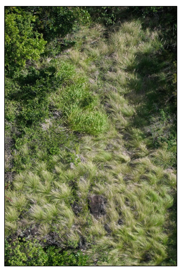
Patch of fountain grass found in the forest of 'Aiea watershed and aerially sprayed.

Unfortunately, OISC was not able to convice the landowner of 'Ōhikilolo Ridge to allow us to use herbicide to treat the plants there. Handpulling plants will not be effective at this location because the steep terrain prevents the crew from safely being able to reach all the plants. However, we have