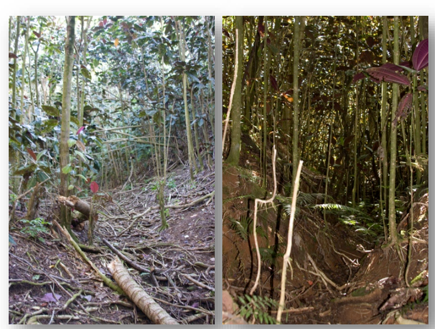
Monotypic stands of miconia in Tahiti, note the lack of understory and exposed roots, a sign of erosion.

Miconia is a high-priority target for OISC because once established, it may severely degrade Oahu's watershed. Miconia's shallow root systems may be unable to hold soil in place during heavy rains and its unusually large leaves funnel rainwater to the ground with tremendous force. These characteristics indicate that a miconia-dominated forest will be more prone to erosion than a native-dominated one. Unfortunately, miconia seeds remain viable in the soil for up to 21 years, making this a project that requires long-term financial comittment. OISC's