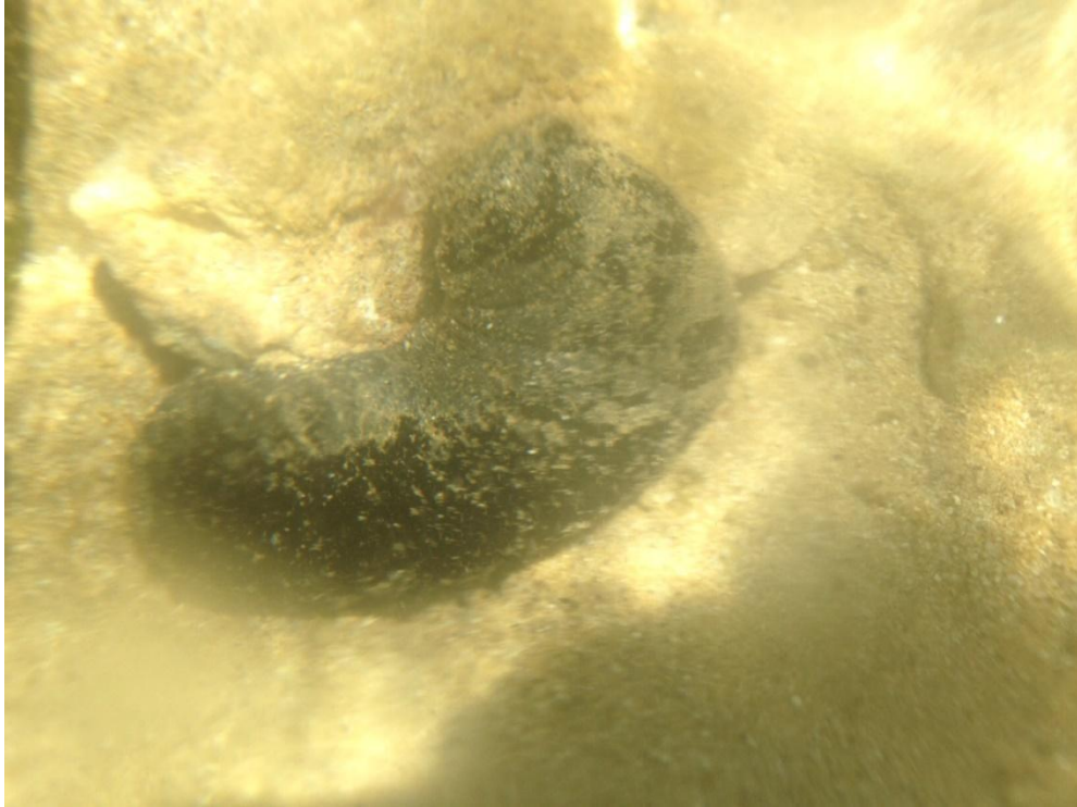
Photo 7- Holothuria whitmaei with sand removed