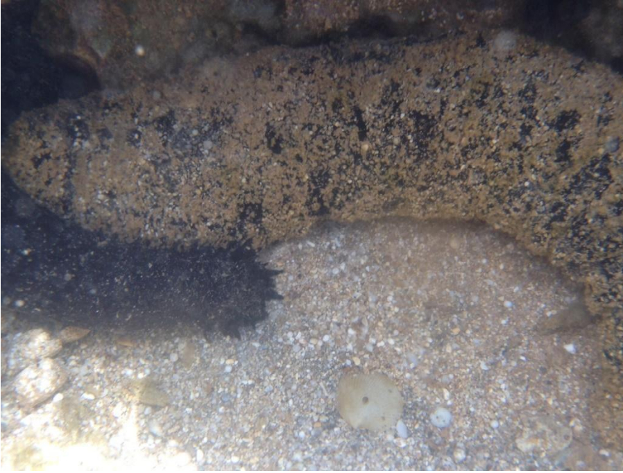
Photo 1- Holothuria atra and Holothuria difficilis displaying clumping.