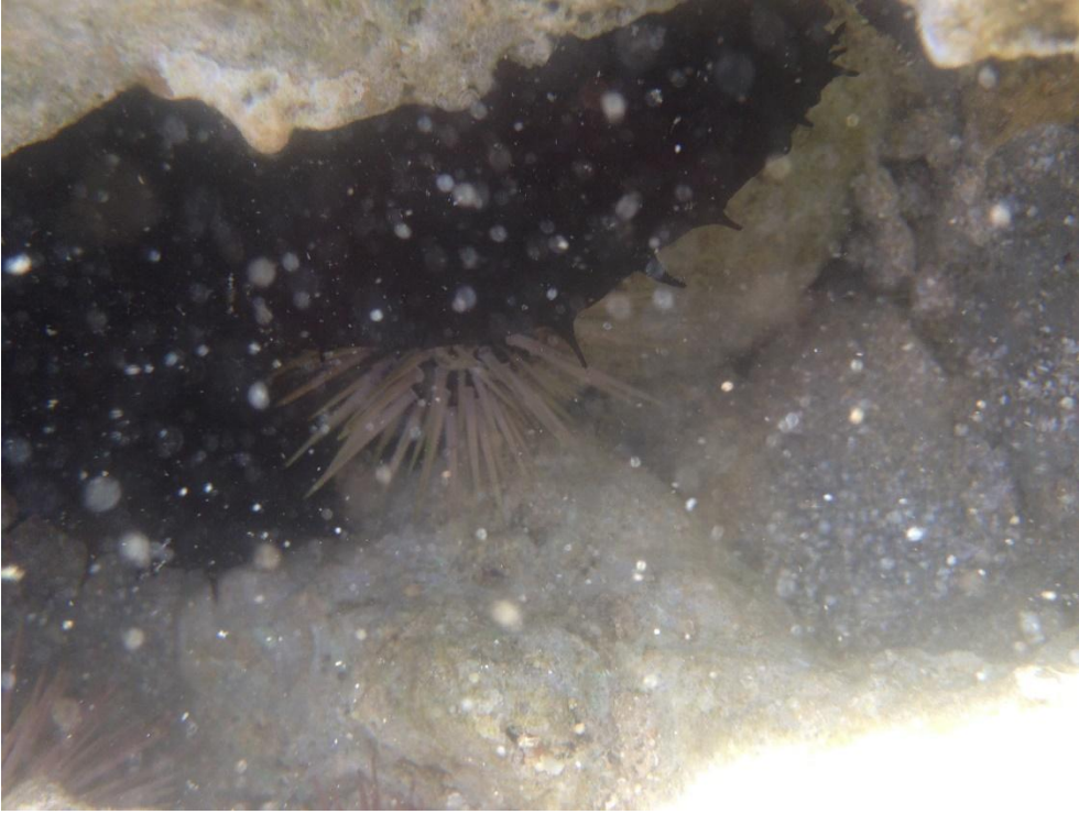
Photo 5- Holothuria difficilis