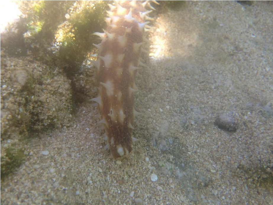
Photo 6- Holothuria hilla