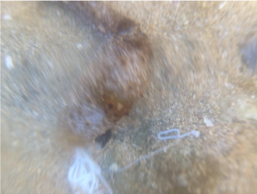
Photo 2- Bohadschia argus emitting its sticky threads