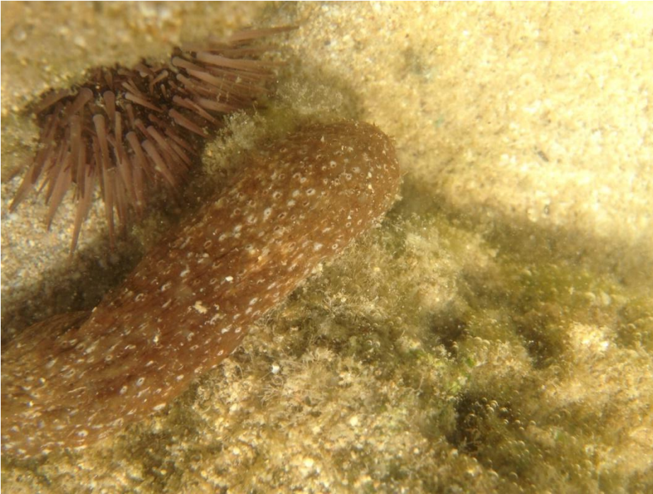
Photo 4- Actinopyga mauritiana