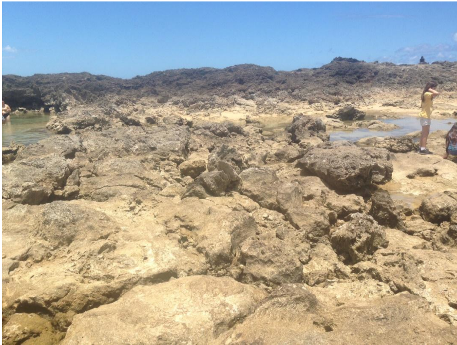
Photo 8- The common substrate.