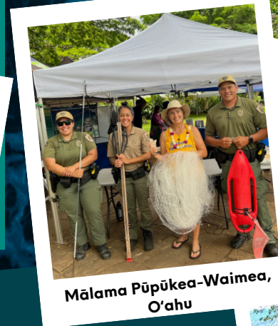
Mālama Pūpūkea-Waimea, O'ahu