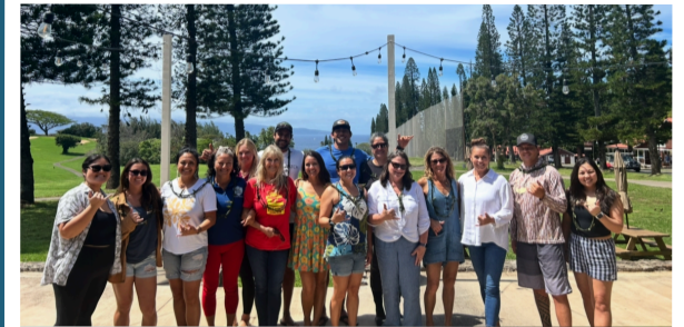
Makai Watch Coordinators' Gathering in Honolua, Maui 2026