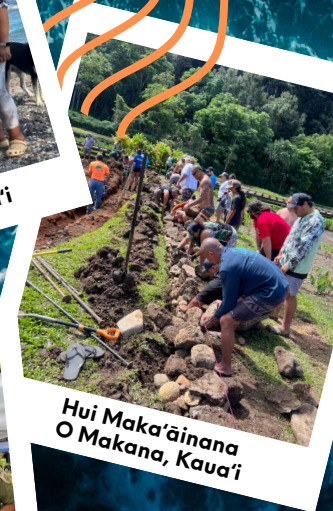
Hui Maka'ainana O Makana, Kaua'i