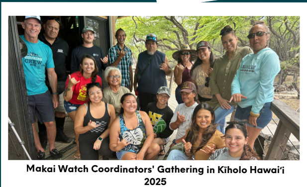
Makai Watch Coordinators' Gathering in Kiholo Hawaii 2025