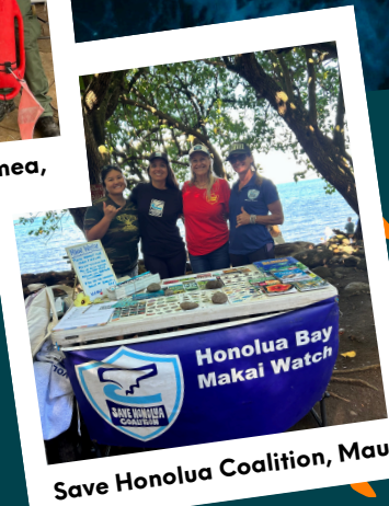
Save Honolua Coalition, Maui