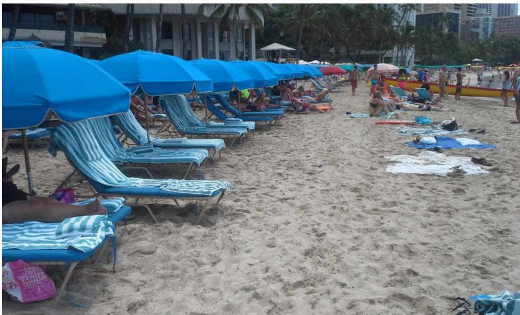
Beach Chairs in front of the Outrigger Waikiki Beach

Commercial activity is not allowed on Waikīkī Beach (Hawaii Administrative Rule (HAR) 255-6-(b)). However, under agreements made by the Legislature in 1928 and 1965, certain portions of the Beach are arguably private property. Under Act 145, Session Laws of Hawaii (SLH) 2014, the Department of Land and Natural Resources (DLNR) began working with the Waikīkī Improvement District and the Royal Hawaiian, Outrigger and Moana Surfrider hotels and their vendors to address the “pre-setting” issue. After two years, the Group had not come to a solution, so the Senate, under Senate Resolution 27, Senate Draft 1, Regular Session of 2016, directed DLNR to continue working on the issue and to provide a progress report to the 2017 Legislature. This report identifies the problem, and provides the solution agreed to by the hotels and their vendors.