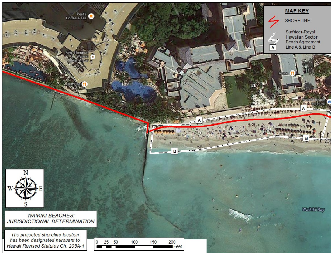
Map of the A and B Lines, and estimated shoreline.

Fifty-one years later, and after numerous attempts to nourish Waikīkī Beach, it continues to erode, and the 75 foot public easement between Lines A and B continues in effect. There are also numerous activities that are arguably commercial taking place within Lines A and B, and perhaps even shoreward of Line B.