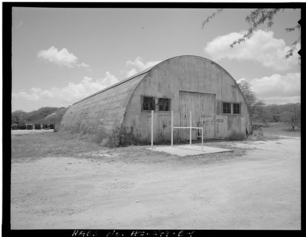
HALS No. H-2-279-0-1