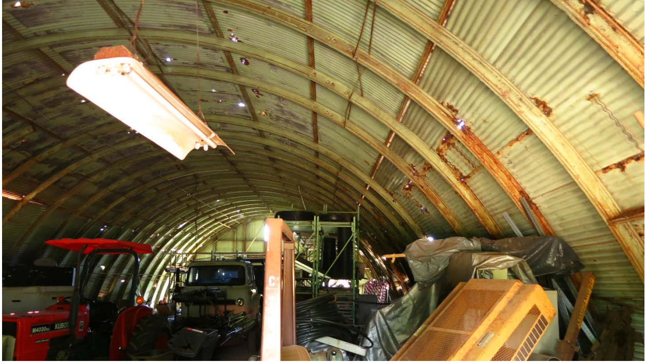
Quonset Hut in the Urban Garden, University of Hawaii College of Tropical Agriculture (inside view)