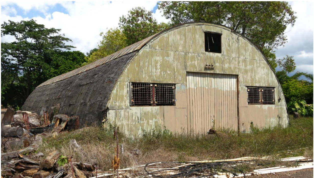
Quonset Hut in the Urban Garden, University of Hawaii College of Tropical Agriculture (outside view)