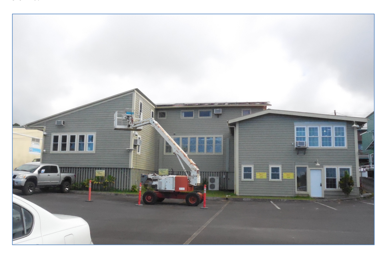
Photo #8 (HI_Hawai'i County_Honoka'a MPS_Awong Brothers Store_0008) Rear façade ( makai side), camera facing south-southwest.