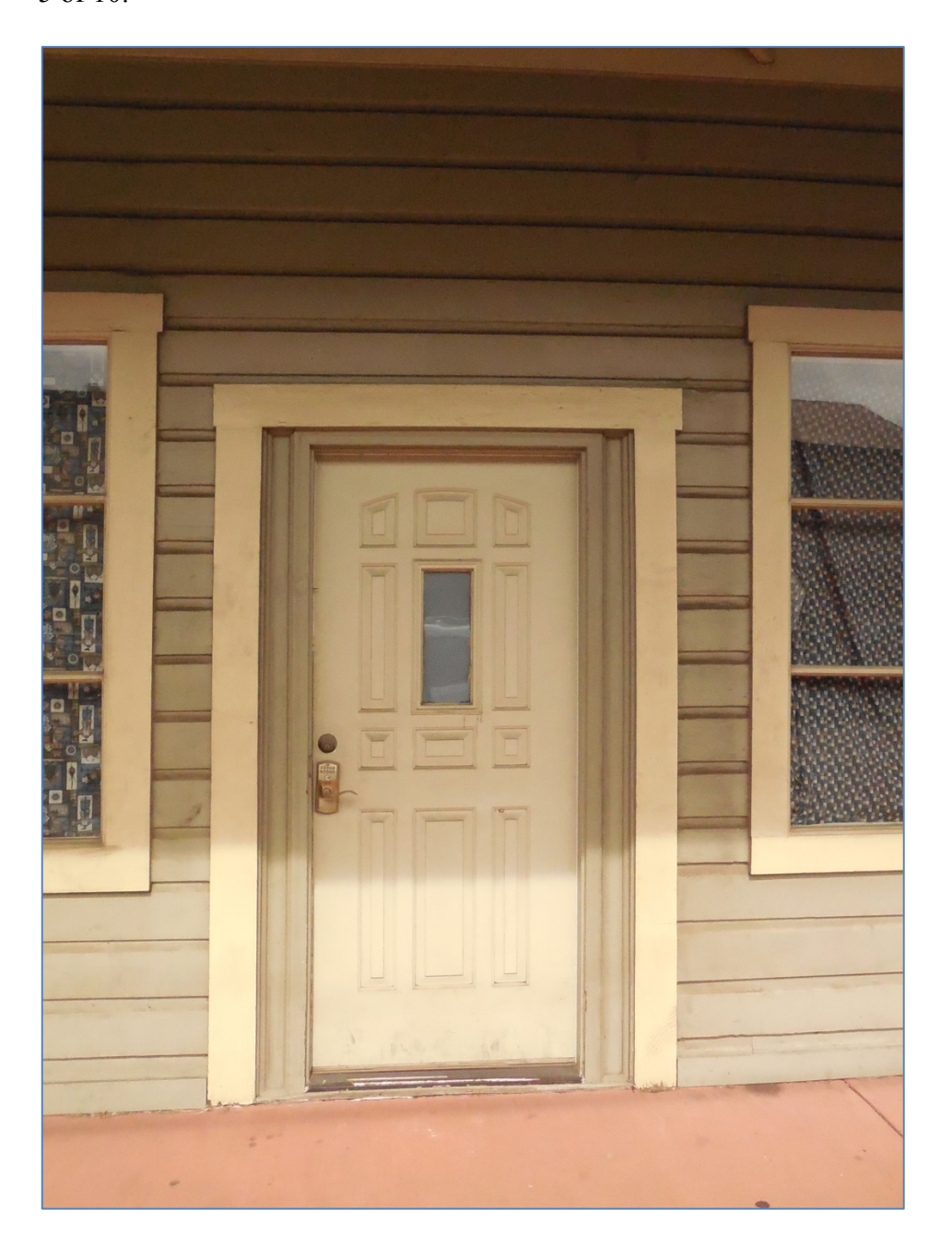
Photo #5 (HI_Hawai'i County_Honoka'a MPS_Awong Brothers Store_0005) External detail: Hilo-side bay, Māmane Street façade ( mauka side), camera facing northnortheast.