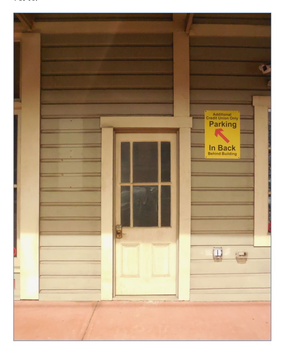
Photo #4 (HI_Hawai'i County_Honoka'a MPS_Awong Brothers Store_0004) External detail: door to second floor stairs. Māmane Street façade ( mauka side), camera facing north-northeast.