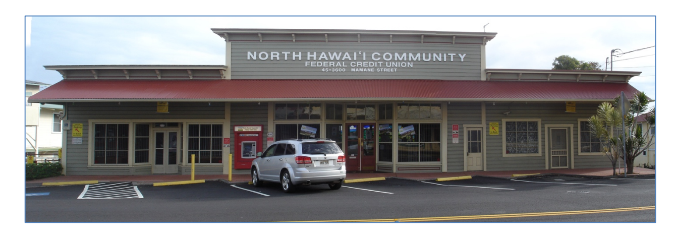
Photo #1 (HI_Hawai'i County_Honoka'a MPS_Awong Brothers Store_0001) Māmane Street façade ( mauka side), camera facing north-northeast.

Description of Photograph(s) and number, include description of view indicating direction of camera: