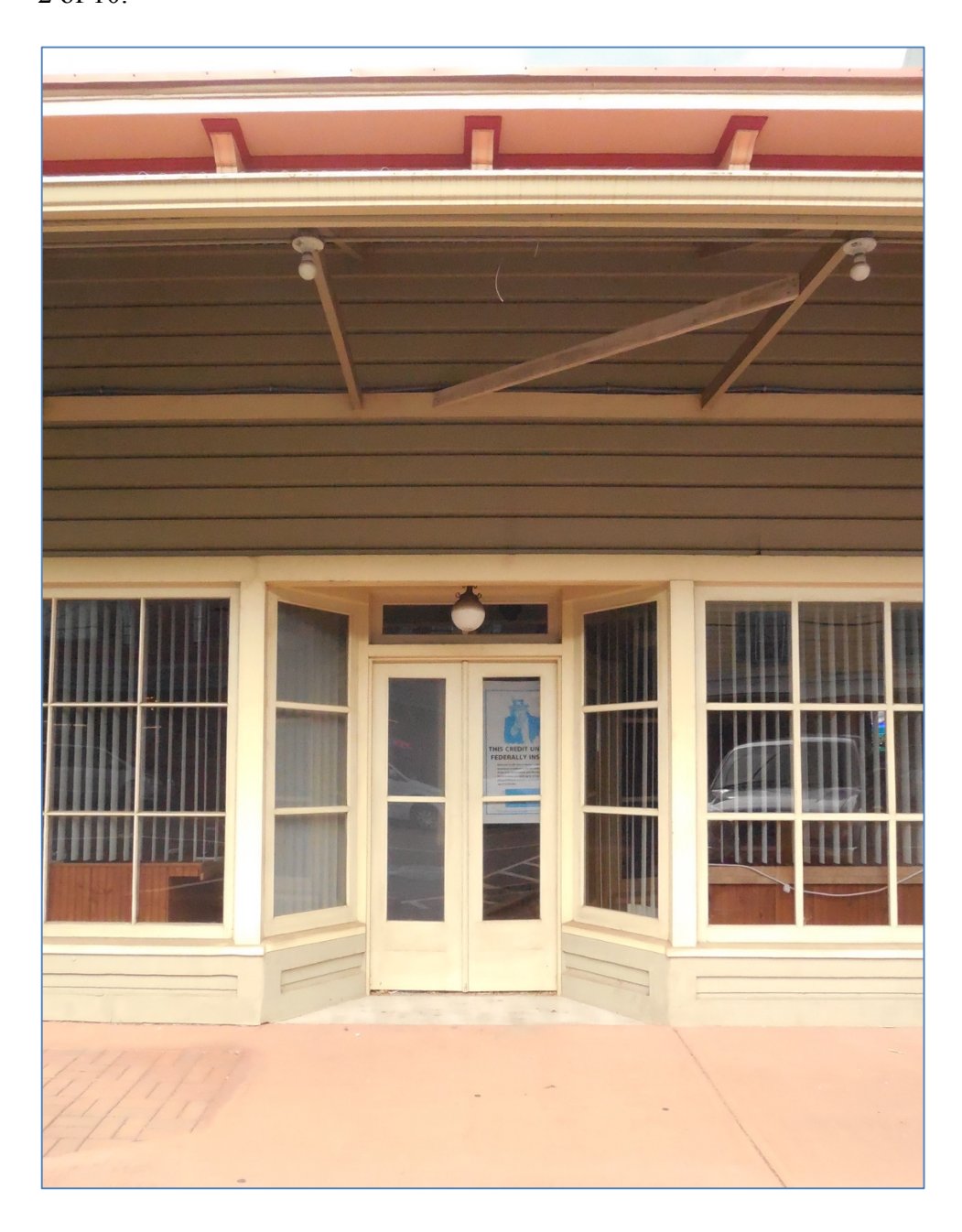
Photo #2 (HI_Hawai'i County_Honoka'a MPS_Awong Brothers Store_0002) External detail: Waipi'o-side bay, Māmane Street façade ( mauka side), camera facing northnortheast.