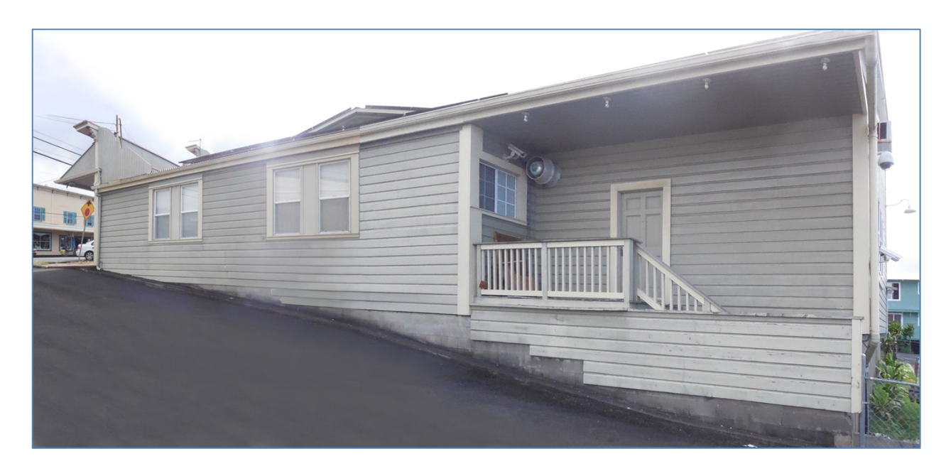
Photo #7 (HI_Hawai'i County_Honoka'a MPS_Awong Brothers Store_0007) Hilo-side façade, camera facing south-southwest.