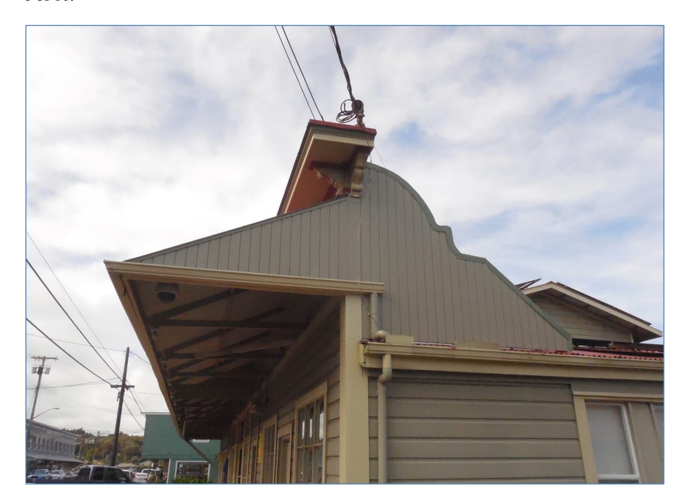
Photo #6 (HI_Hawai'i County_Honoka'a MPS_Awong Brothers Store_0006) External detail:, Māmane Street façade ( mauka side), showing pedestrian awning and Hilo-side façade showing parapet side, camera facing north-northwest.