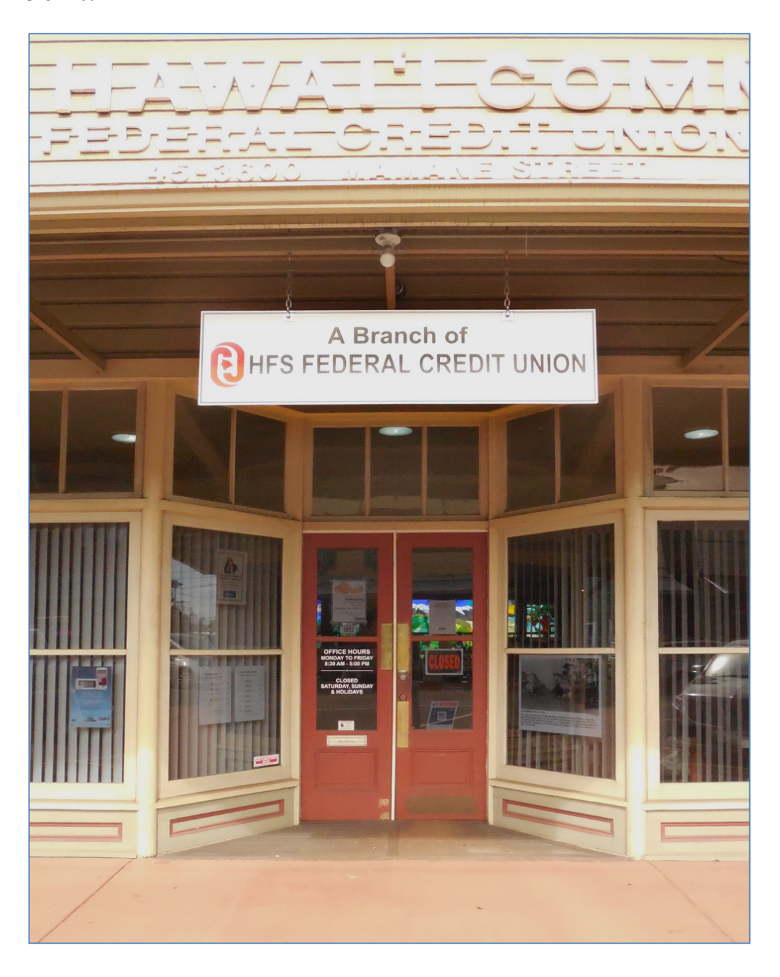
Photo #3 (HI_Hawai'i County_Honoka'a MPS_Awong Brothers Store_0003) External detail: center bay, Māmane Street façade ( mauka side), camera facing north-northeast.