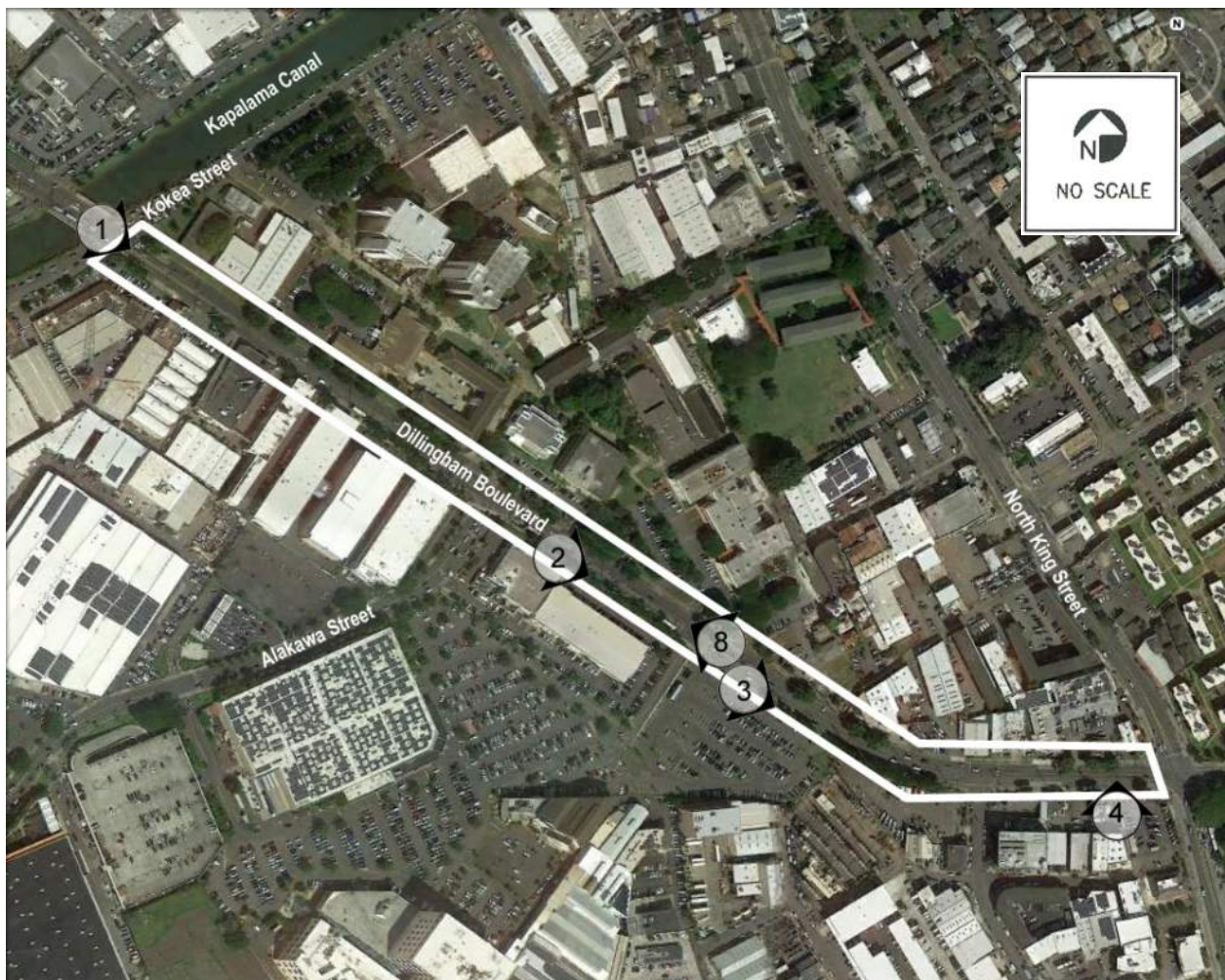
Photo key map. Photos 5-7 are details and are not included in this key.