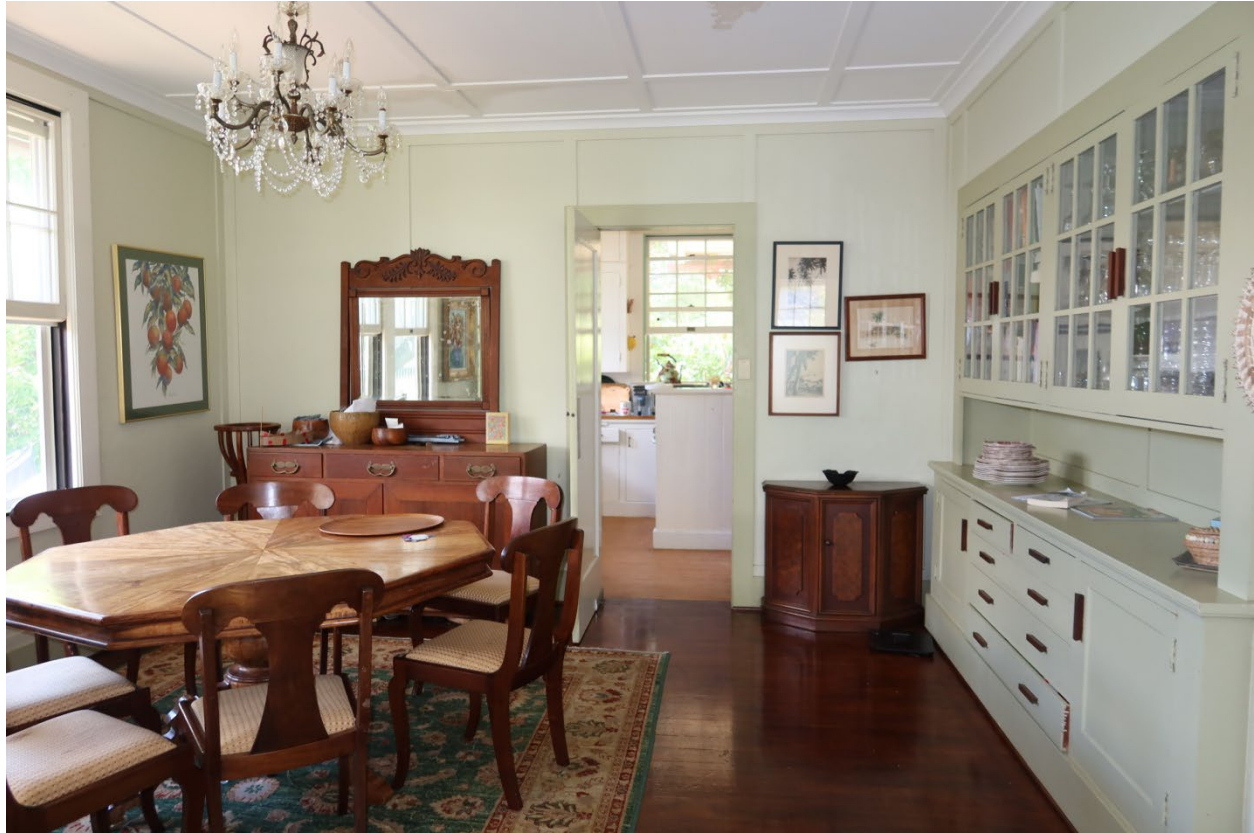
View of the dining room from the north