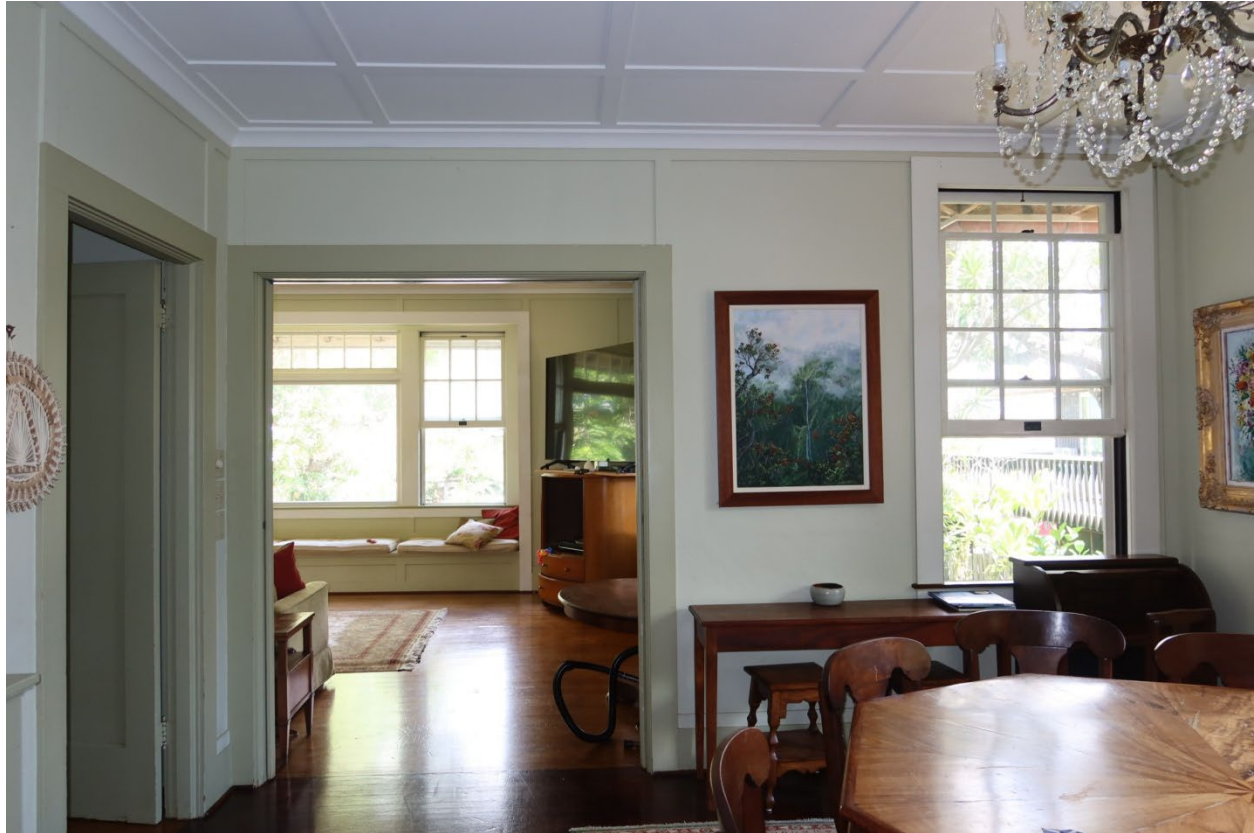
View of the dining room from the south, living room in background