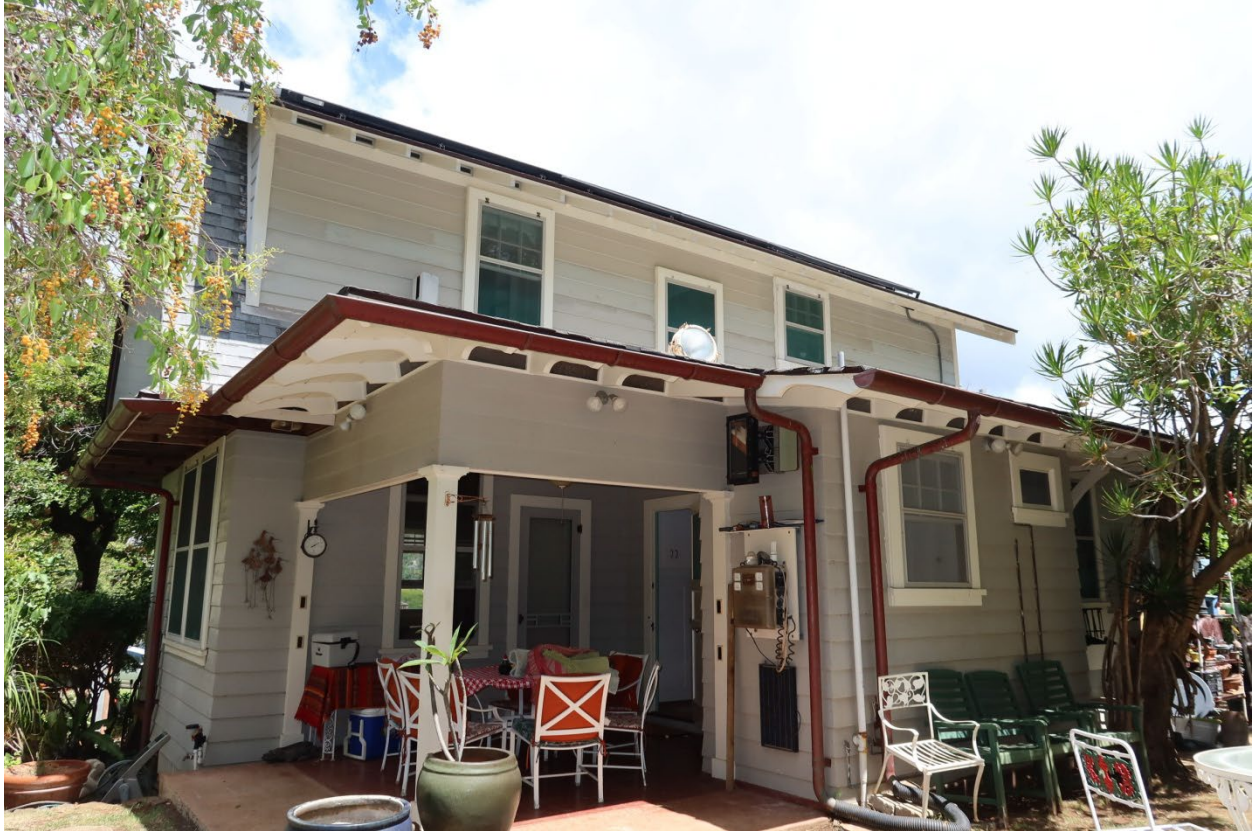
View of the rear of the house with lanai from the southwest