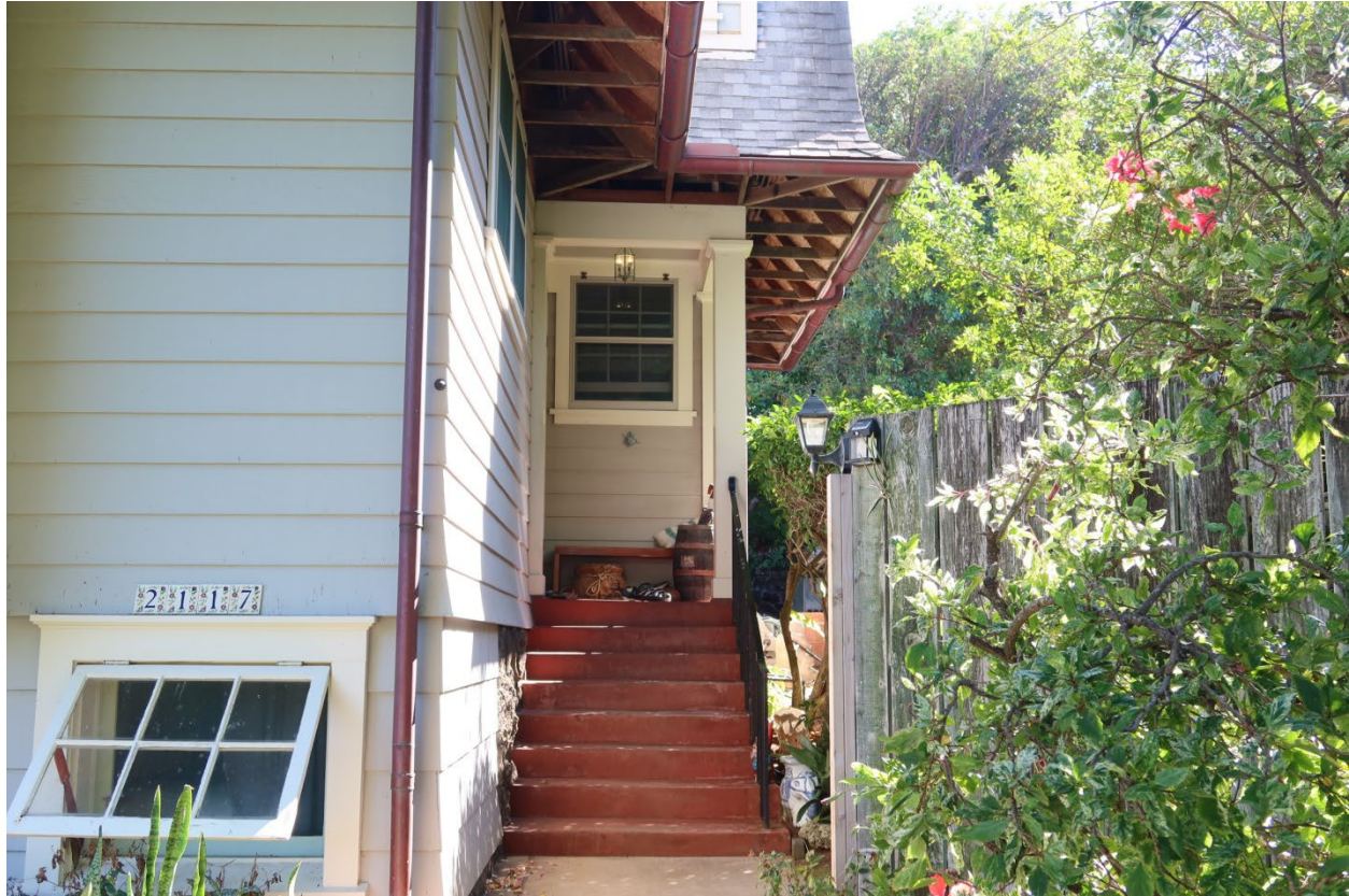
View of the entry from the north