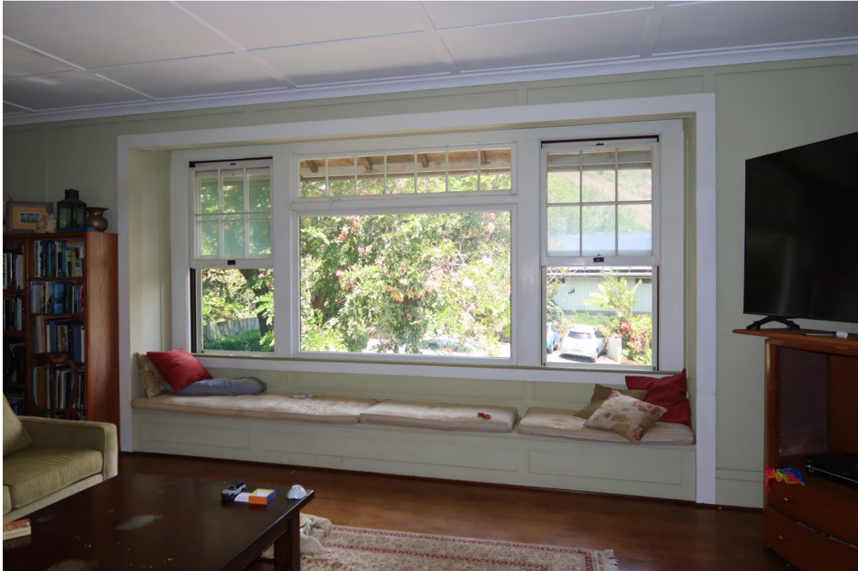
View of the living room box bay window from the south