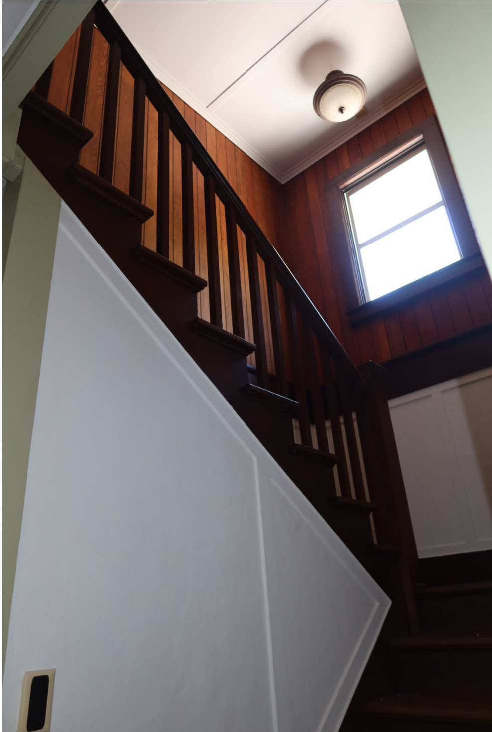
View of the stairs from the northwest Sections 9-end page 33