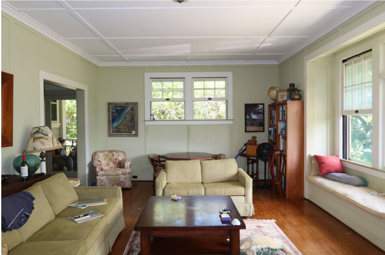
View of the living room from the east