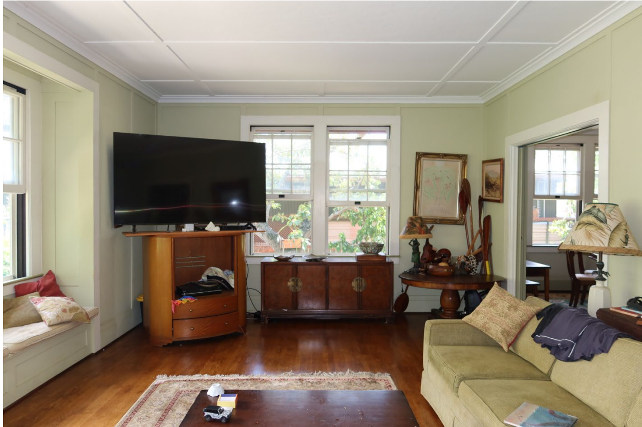
View of the living room from the west