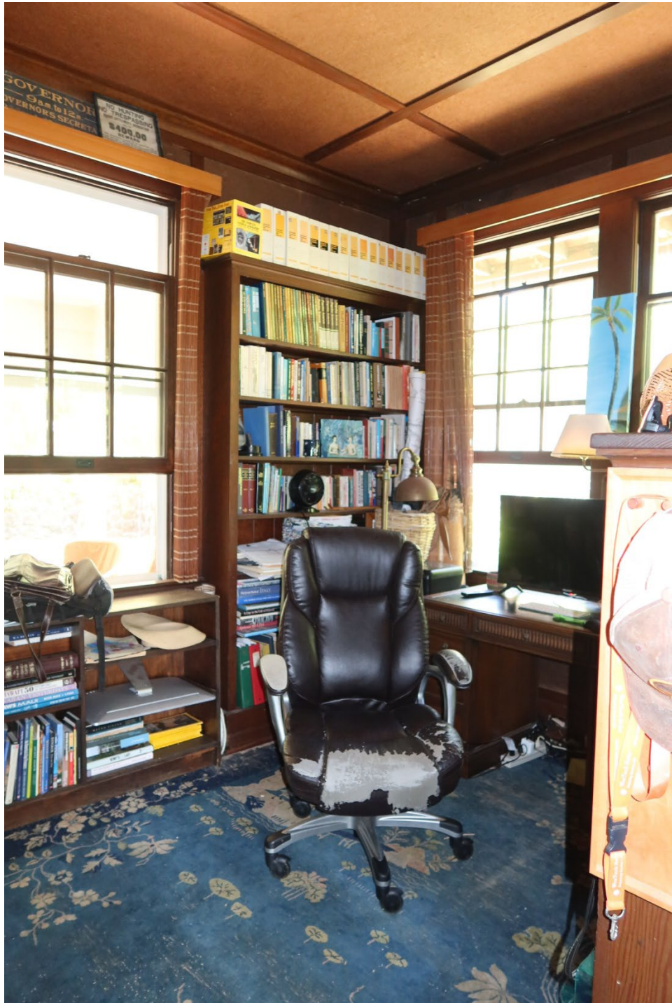
View of the study from the northeast Sections 9-end page 25