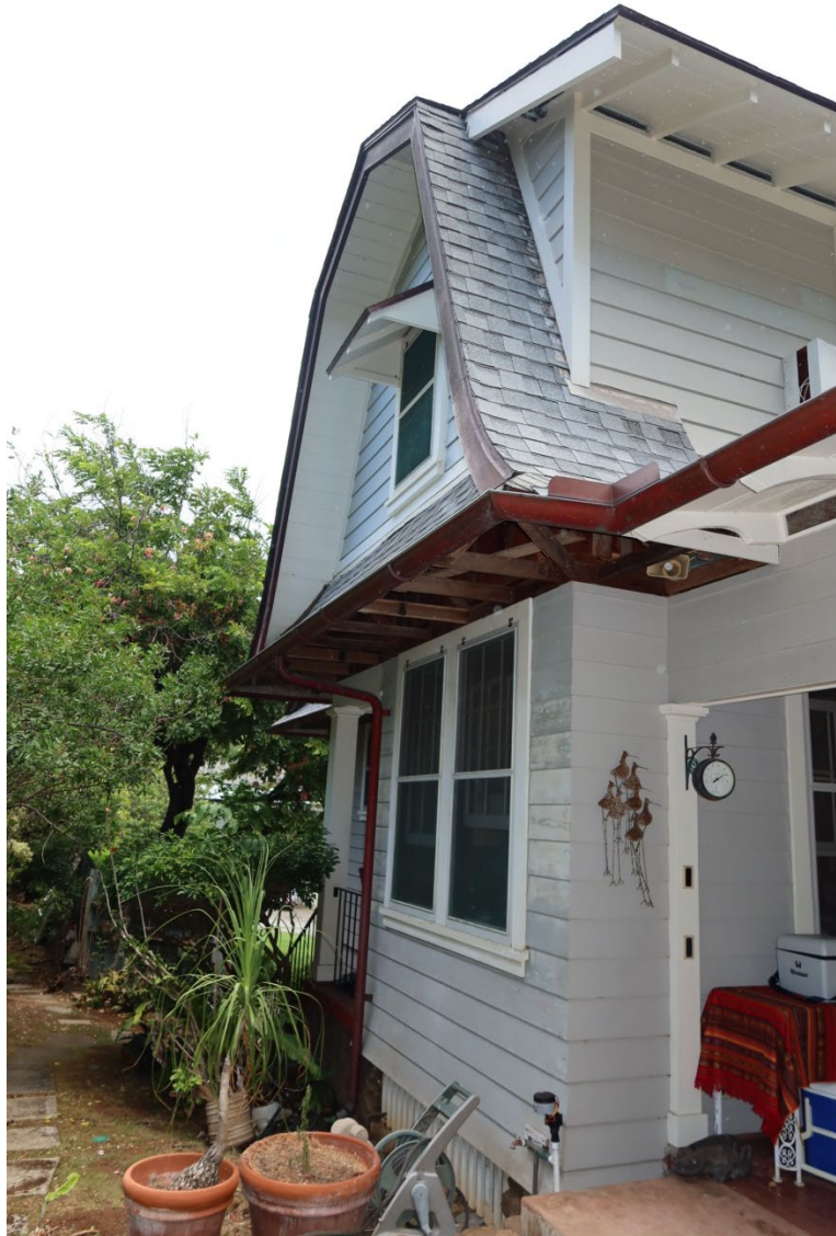
View of the west side from the southwest