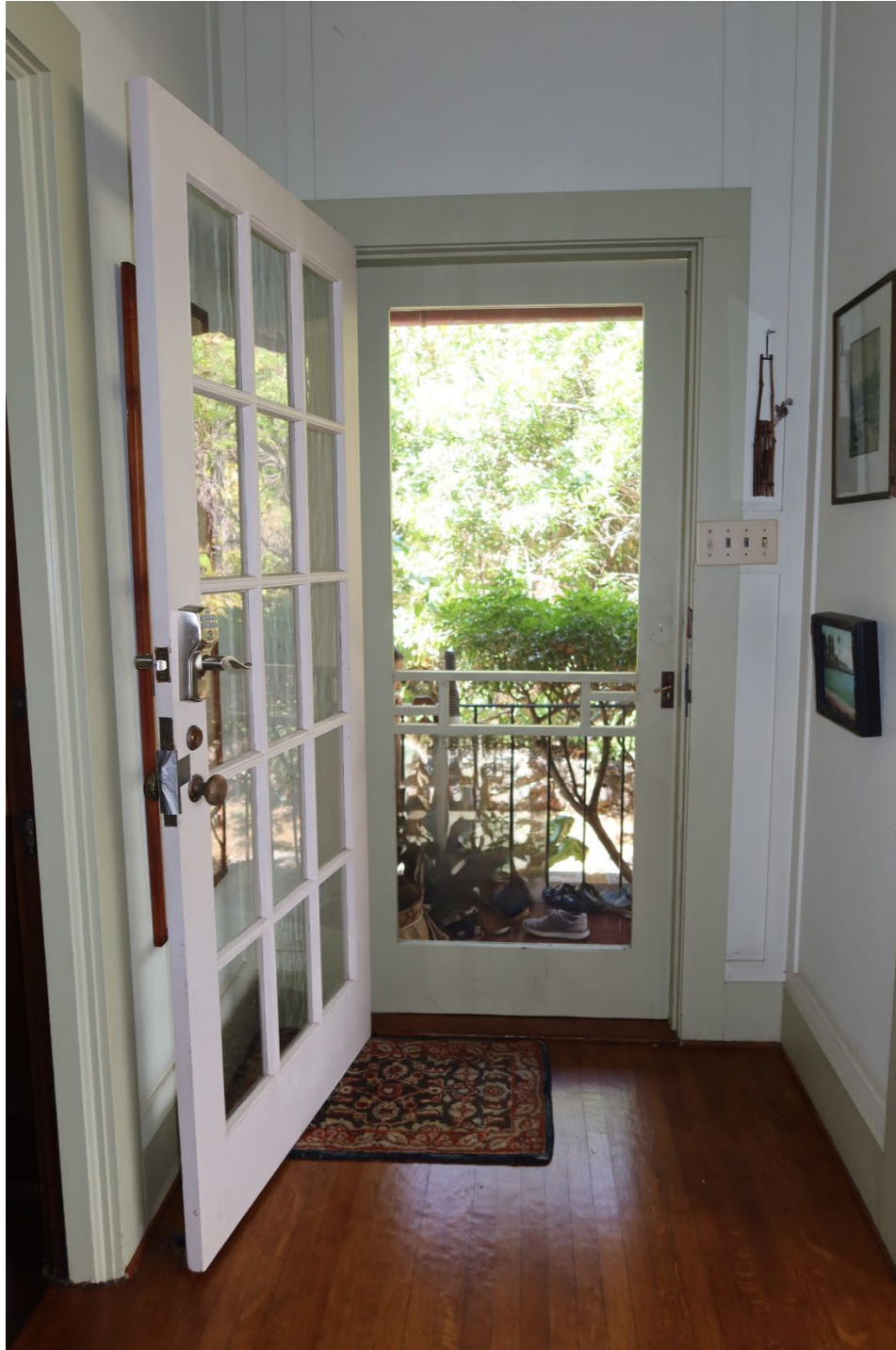
View of the entry hall from the east