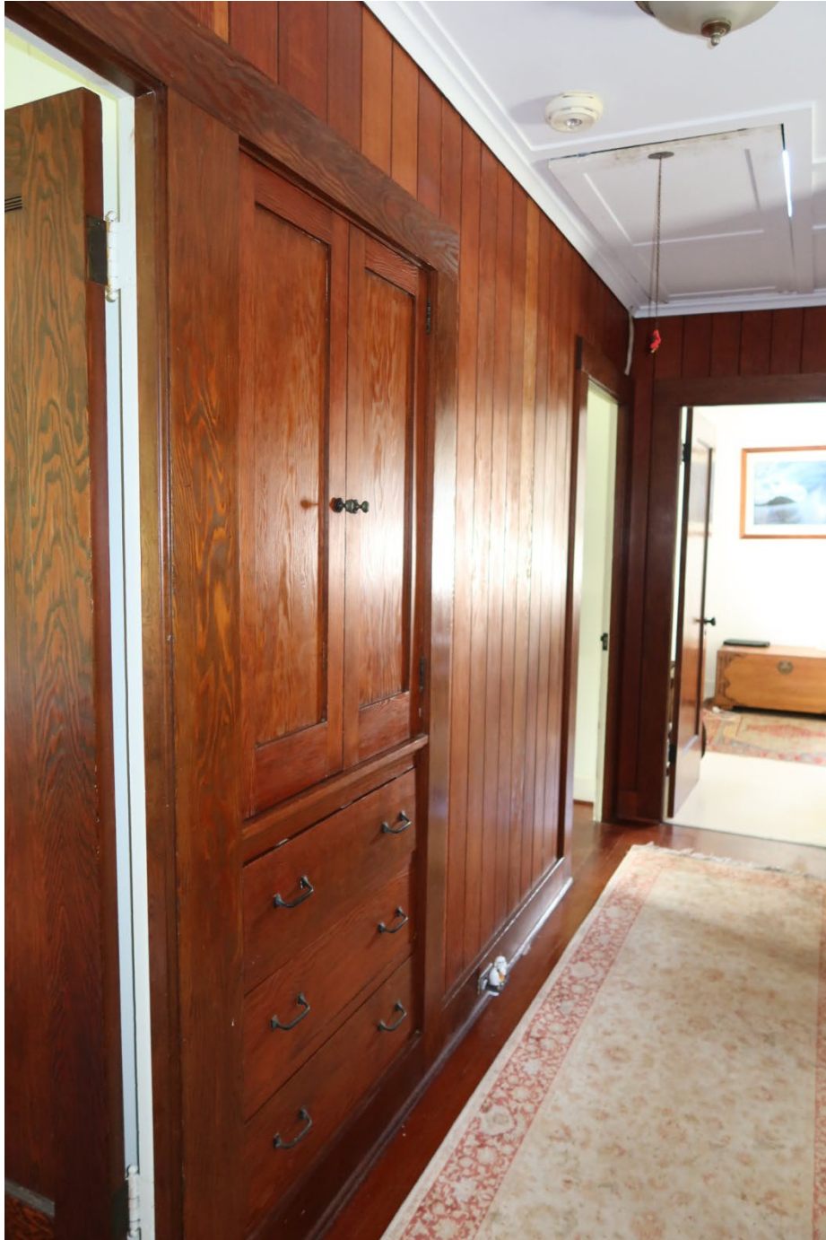
View of the second floor hall from the west