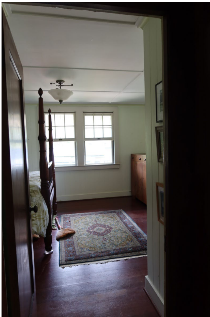
View of the northeast bedroom from the south

Paperwork Reduction Act Statement: This information is being collected for nominations to the National Register of Historic Places to nominate properties for listing or determine eligibility for listing, to list properties, and to amend existing listings. Response to this request is required to obtain a benefit in accordance with the National Historic Preservation Act, as amended (16 U.S.C.460 et seq.). We may not conduct or sponsor and you are not required to respond to a collection of information unless it displays a currently valid OMB control number.