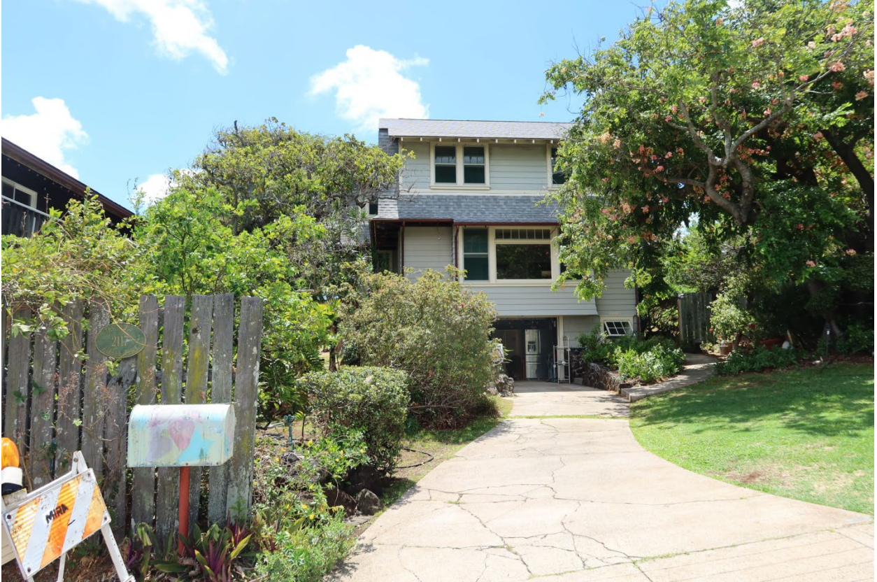
View of the front from the north