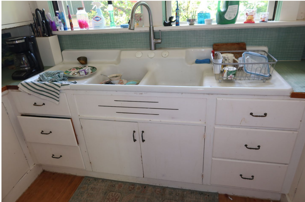
View of the kitchen sink from the west