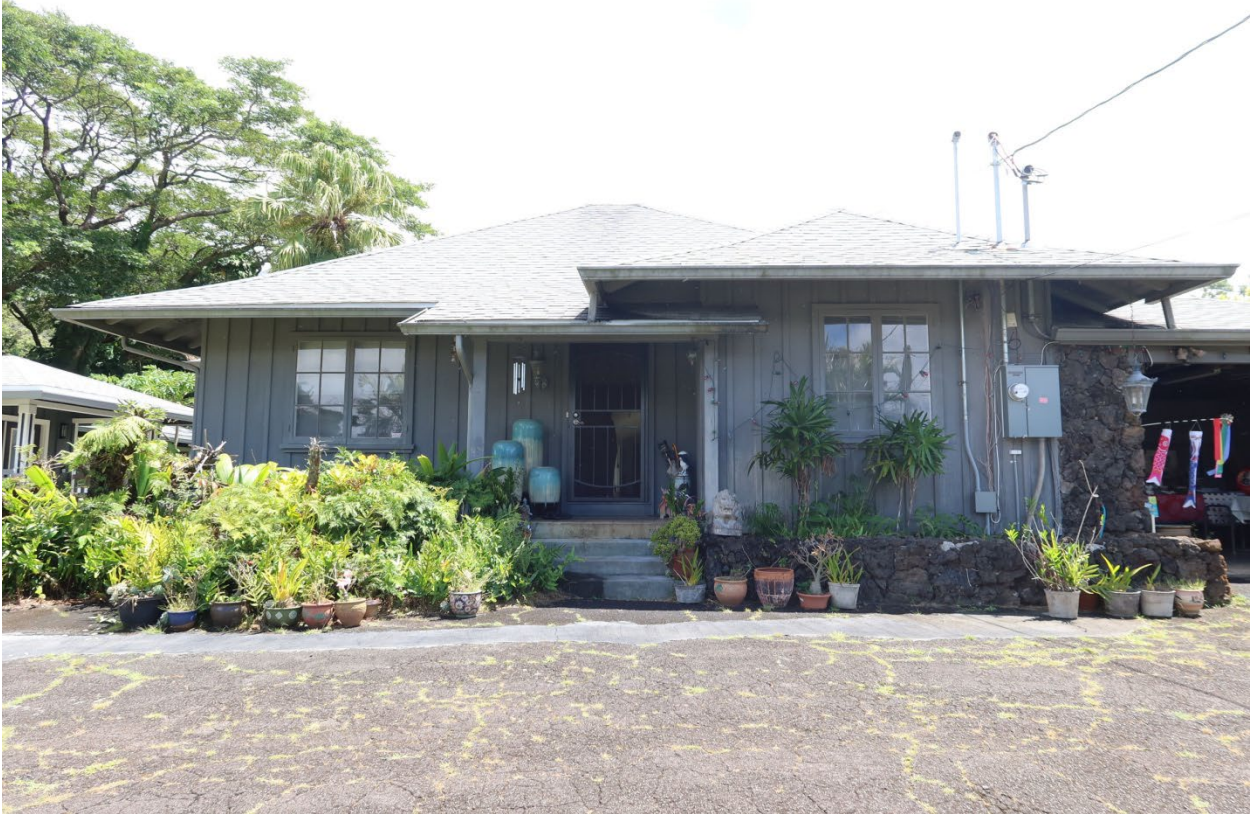
View of the front from the southwest