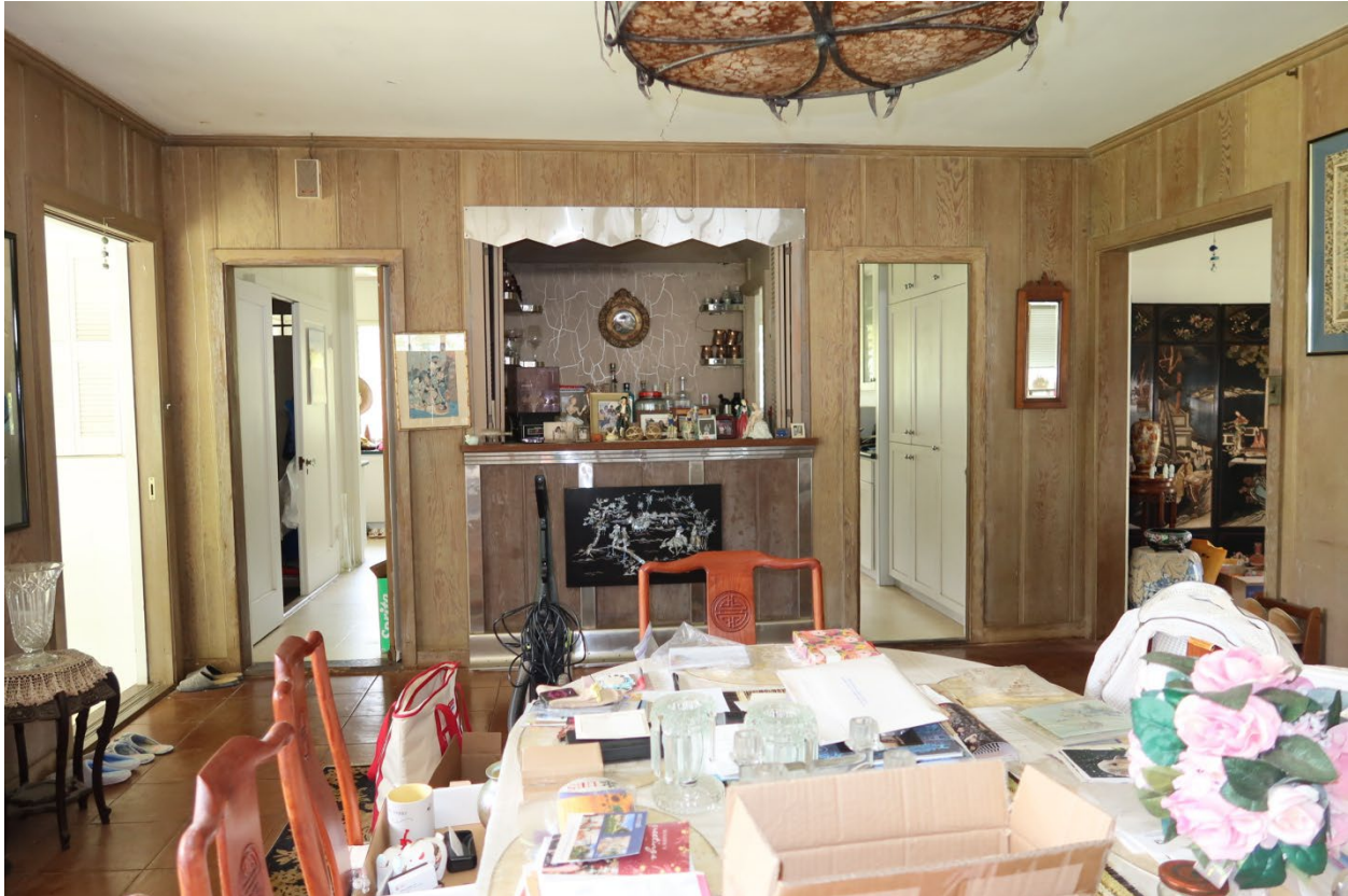
View of bar and doors to kitchen from the northwest