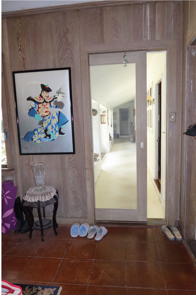
View of the screen pocket door between enclosed dining lanai and galley from the southwest