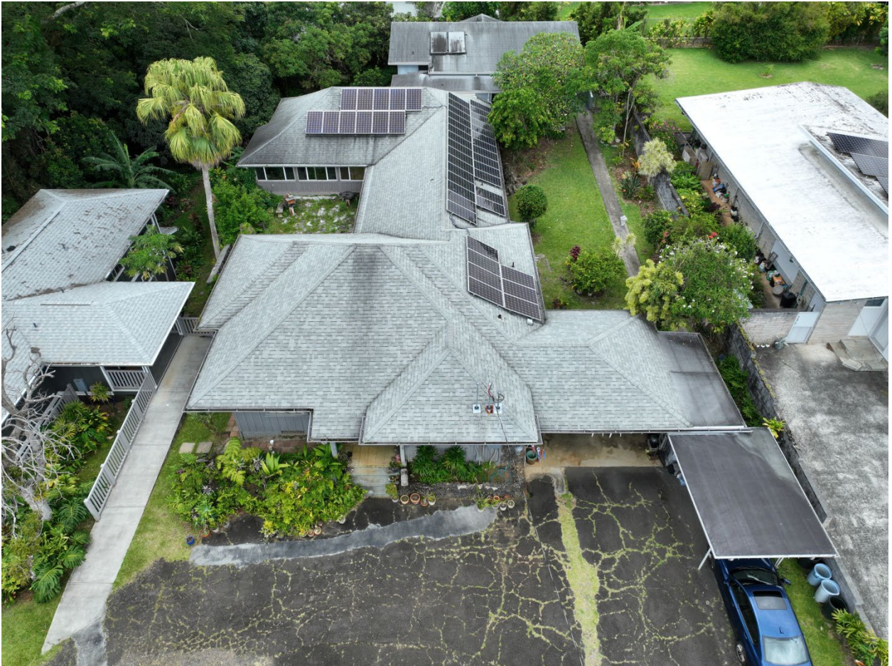
Drone view of the house from the southwest