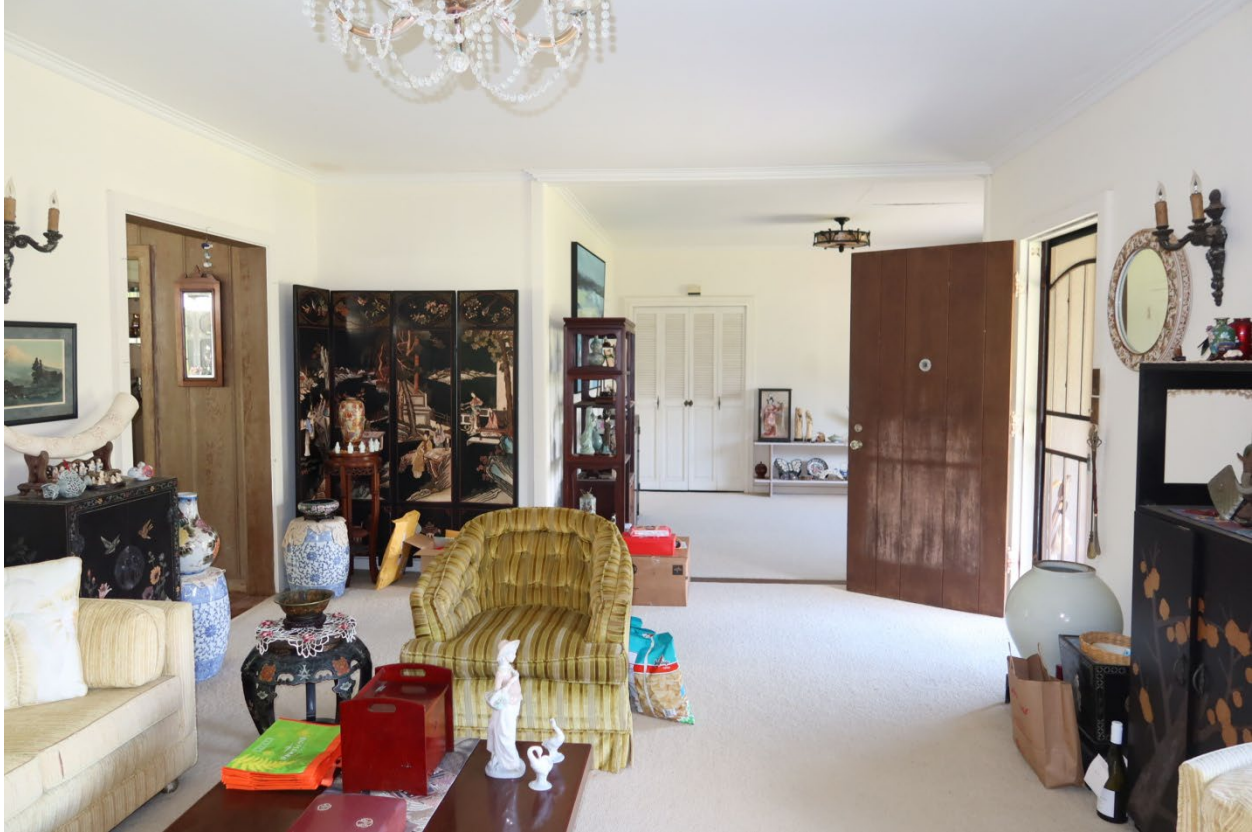
View of the living room looking into the sitting room from the northwest