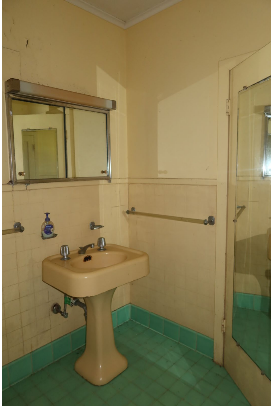
View of the Jack and Jill bathroom from the north