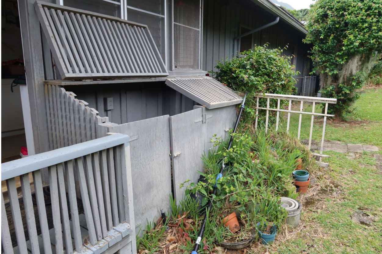
View of the garbage can storage from the south