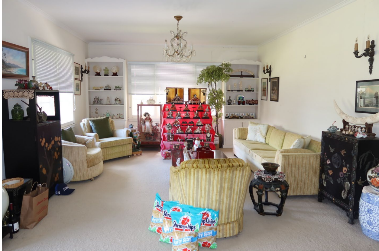
View of living room from the southeast