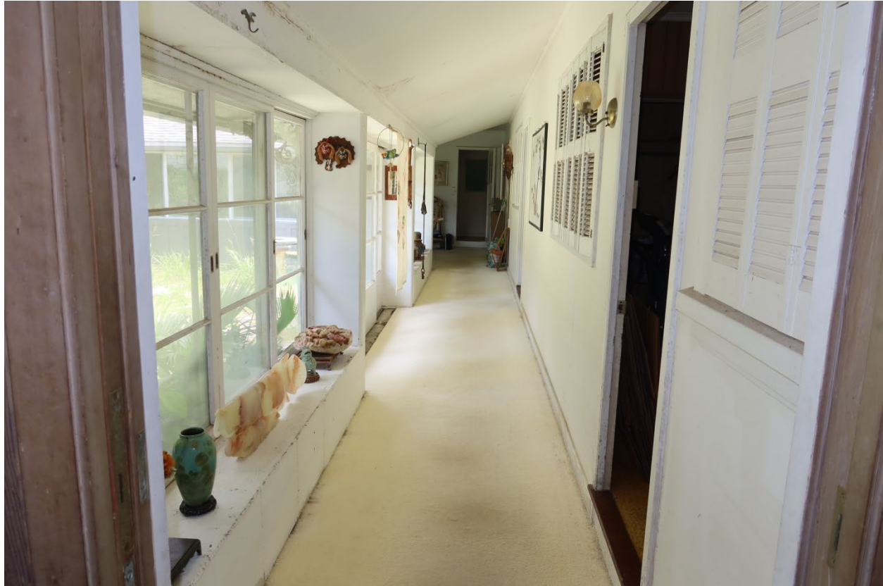
View of the hallway-galley from the southwest