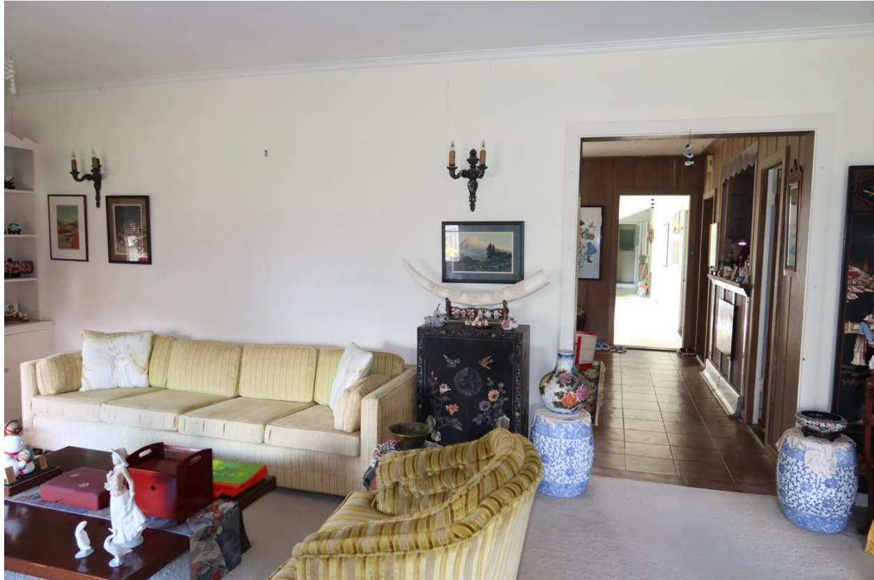
View from the living through the enclosed dining lanai to the hallway/galley from the southwest