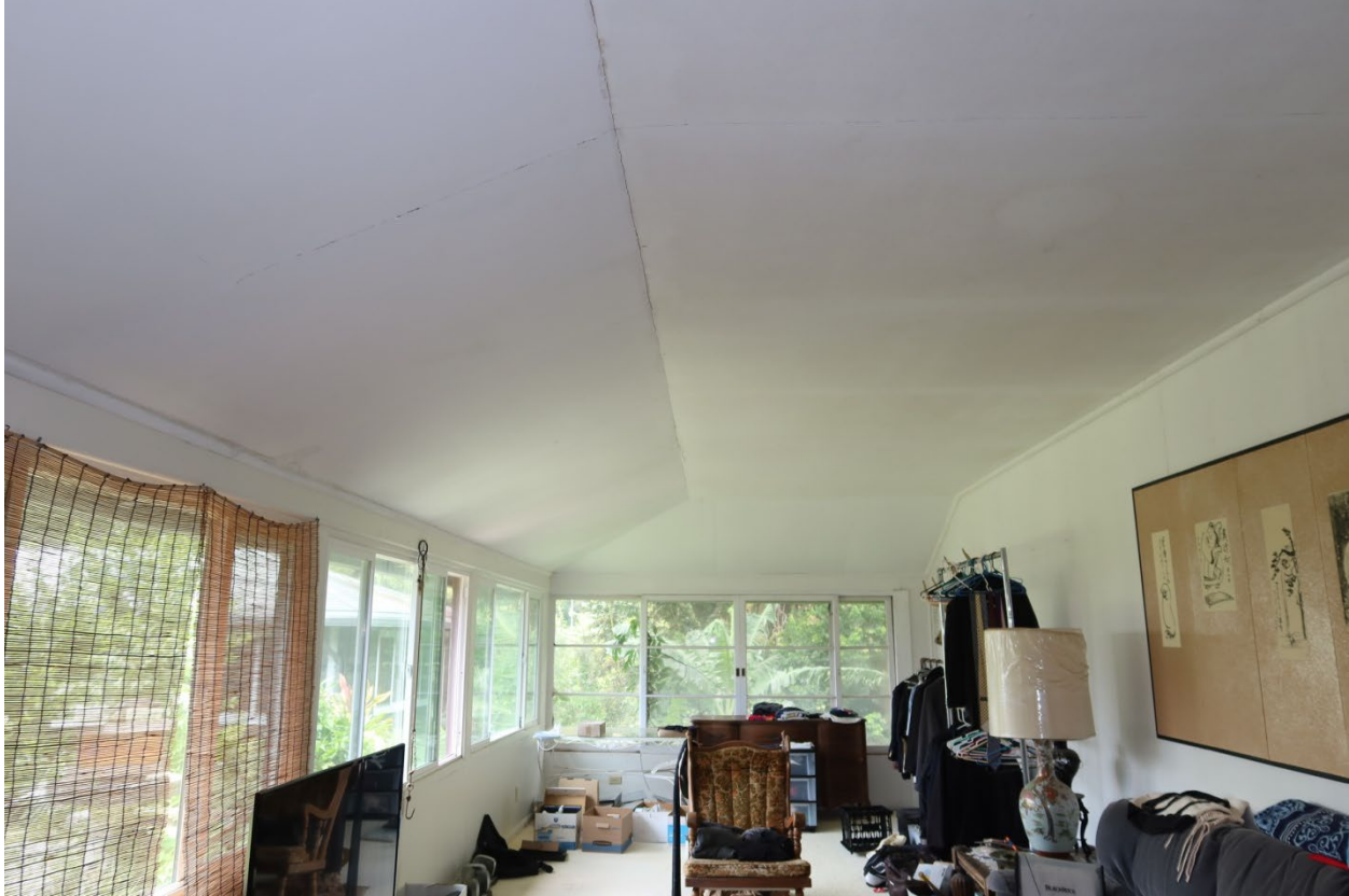
View of the rear enclosed lanai from the southeast