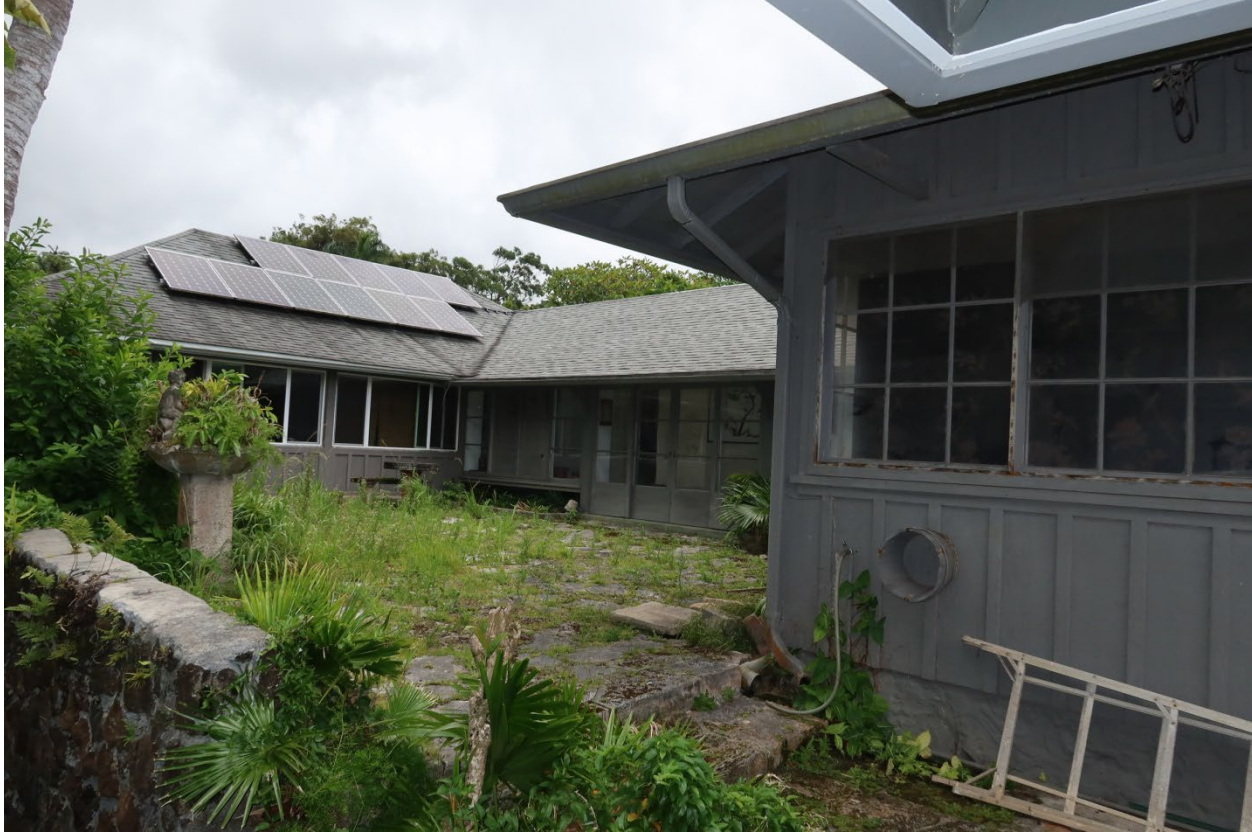
View of the courtyard from the west