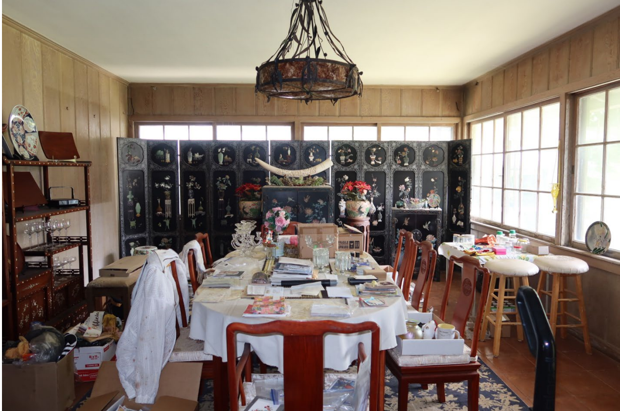
View of the enclosed dining lanai from the southeast