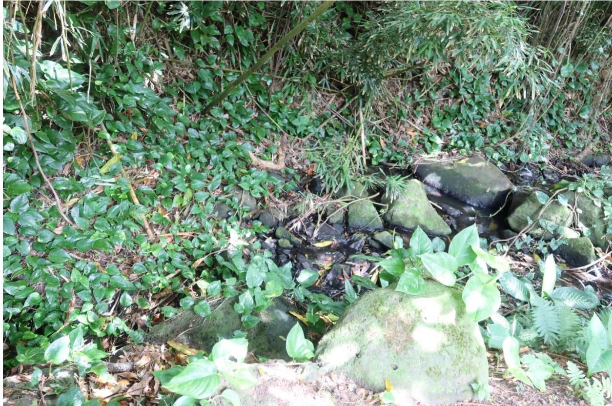
View of the auwai from the south

Paperwork Reduction Act Statement: This information is being collected for nominations to the National Register of Historic Places to nominate properties for listing or determine eligibility for listing, to list properties, and to amend existing listings. Response to this request is required to obtain a benefit in accordance with the National Historic Preservation Act, as amended (16 U.S.C.460 et seq.). We may not conduct or sponsor and you are not required to respond to a collection of information unless it displays a currently valid OMB control number.