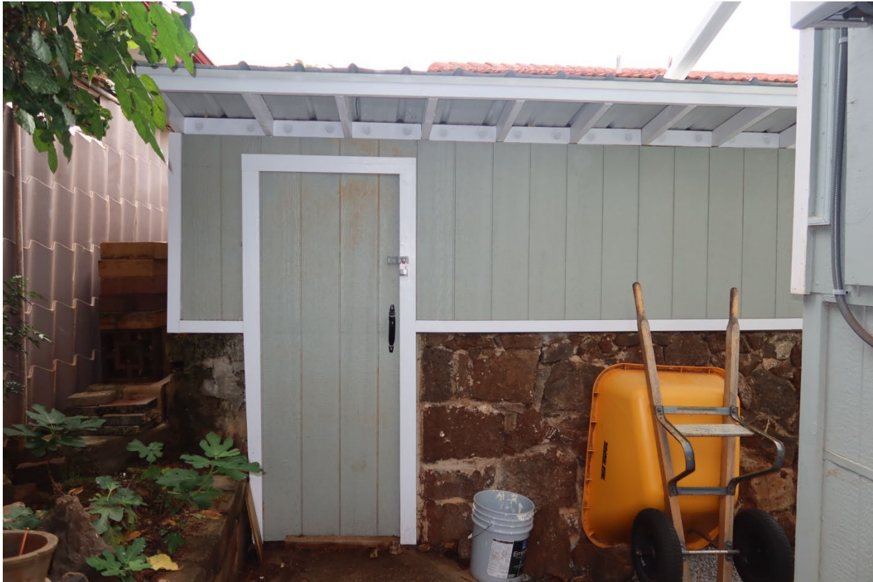
View of the former fernery from the east