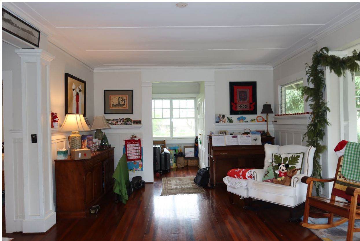
View of the living room from the south, foyer in background