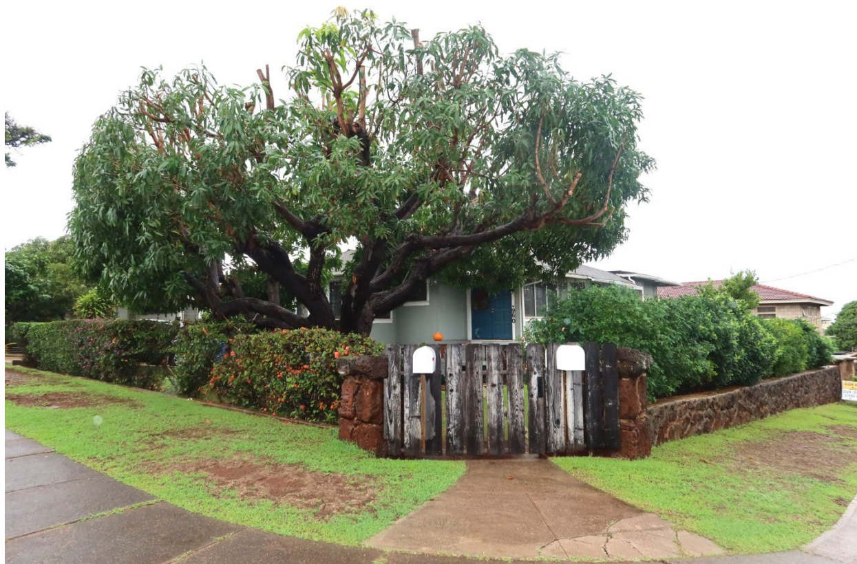
View of the property's corner gate, mango tree, and walls from the northeast

Paperwork Reduction Act Statement: This information is being collected for nominations to the National Register of Historic Places to nominate properties for listing or determine eligibility for listing, to list properties, and to amend existing listings. Response to this request is required to obtain a benefit in accordance with the National Historic Preservation Act, as amended (16 U.S.C.460 et seq.). We may not conduct or sponsor and you are not required to respond to a collection of information unless it displays a currently valid OMB control number.