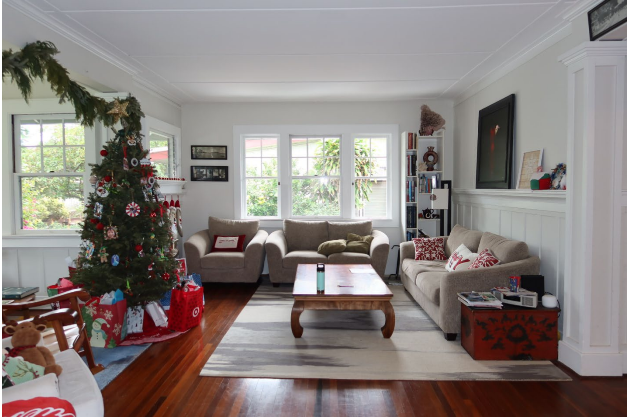
View of the living room from the north