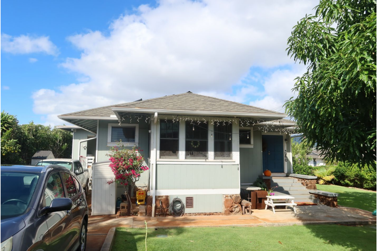
View of the front from the east