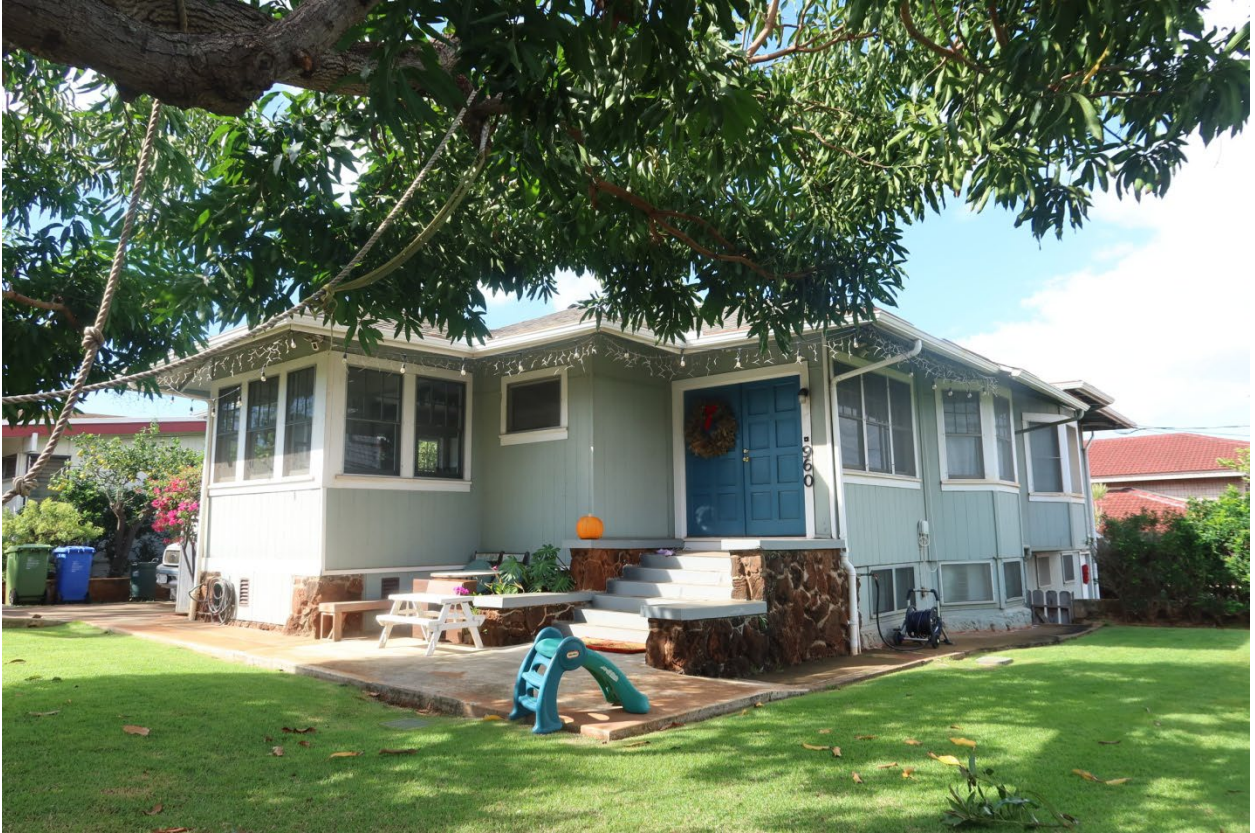
View of the front and side from the northeast