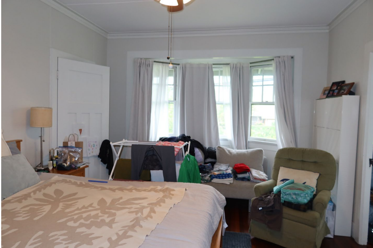
View of the bay window in the front bedroom from the south