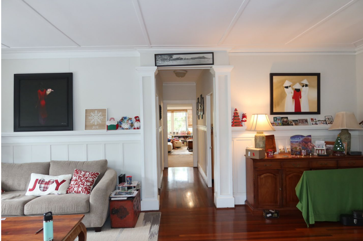
View of the hallway from the east