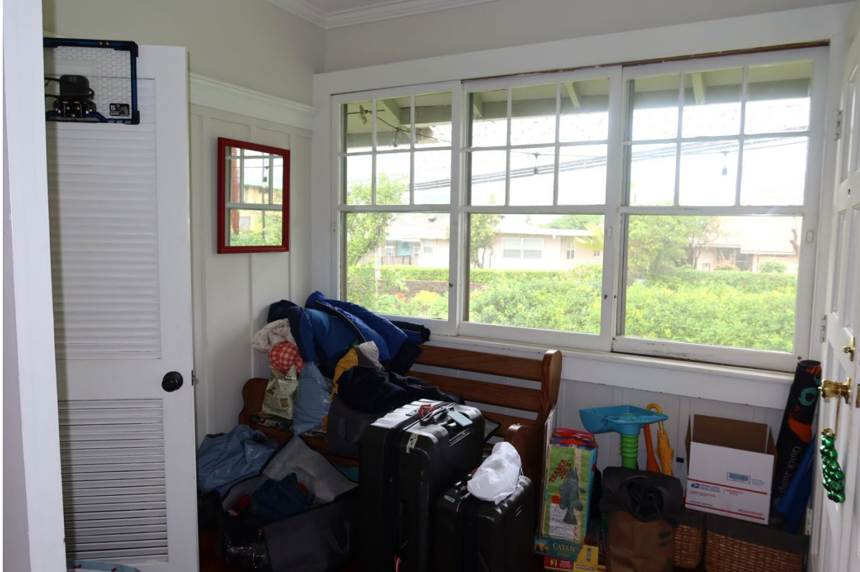
View of the foyer from the southeast