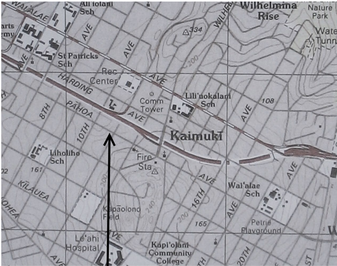
Charles A. and Elma Kirstein Residence USGS 7.5 minute series, Honolulu Quadrangle, 1998 (portion)

USGS map with arrow pointing to the location of the house