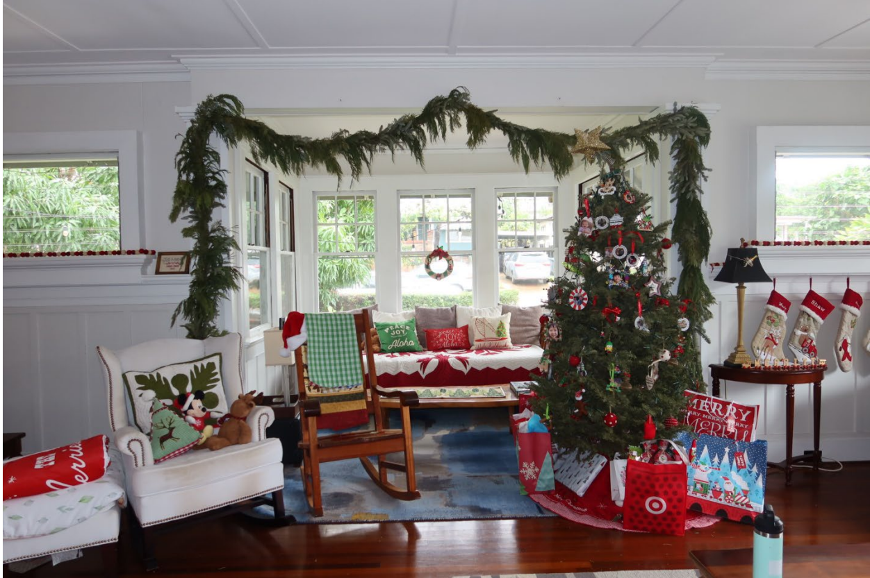
View of the sun room from the west