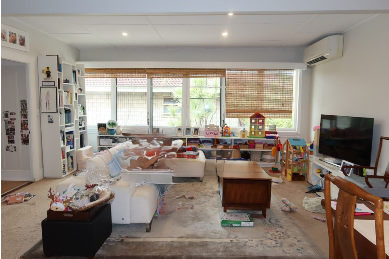
View of the family room from the east