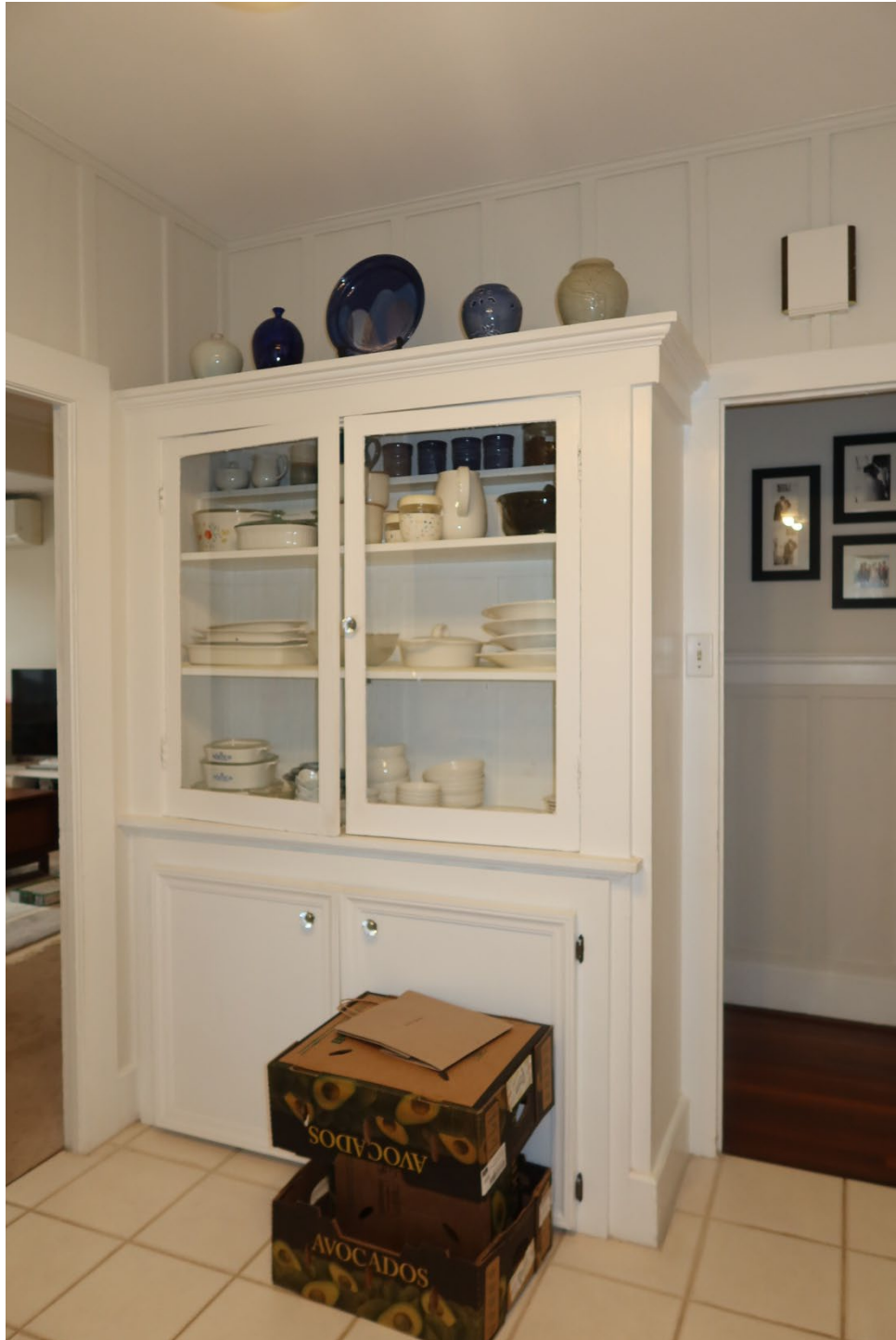
View of the original cabinets in the kitchen from the south