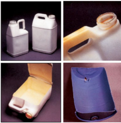
Rinsed, stained and residue-free. Caps and labels removed.