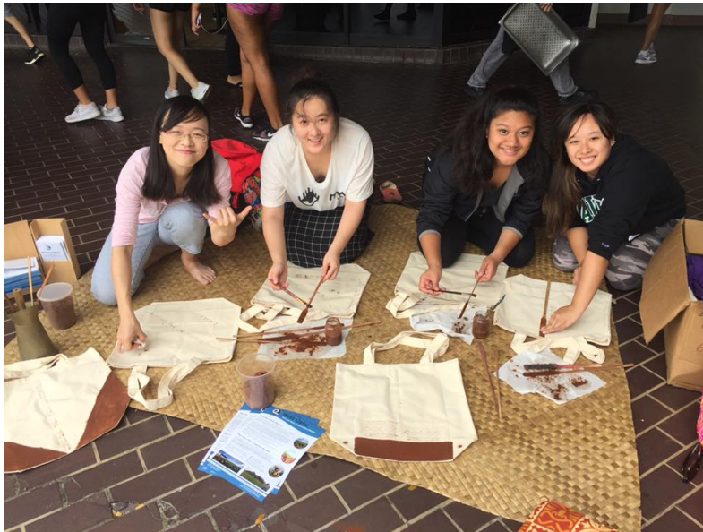
West Oahu SWCD celebrated Earth Day with an artistic, regional look at soils of O'ahu with students and community at the University of Hawaii at Mānoa. Mahalo to the partners at Sustainable UH for hosting.

Oahu's Disaster Assistance Referral List http://www.honolulu.gov/rep/site/dem/DRC_Agencies.pdf