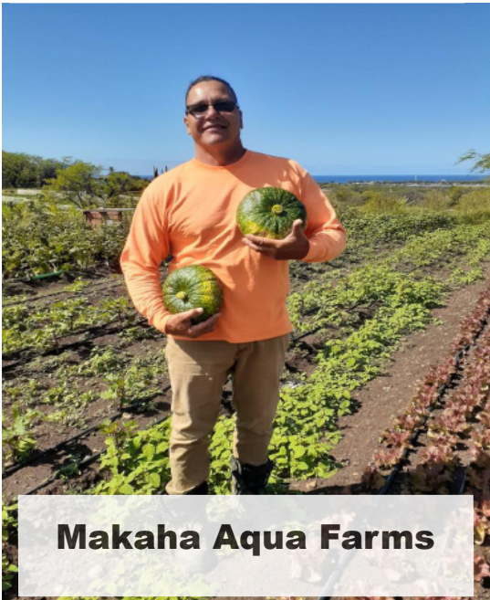
Makaha Aqua Farms