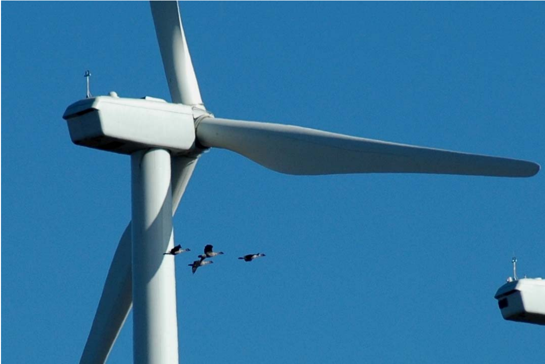
Figure 1. A flock of four adult Nene in flight passing between wind turbine towers and negotiating moving rotors at the Kaheawa Pastures Wind Energy Facility, West Maui, Hawaii, June 2006.

Repeated observations suggest Nene are capable of anticipating structures and exhibiting avoidance behavior relative to moving structures in their airspace. Moreover, no near misses were observed during any surveys that would suggest birds had difficulty adjusting course or were significantly compromised in their flight paths. Surveys will continue through the remainder of the first year of operation (June 2007). Future efforts will include attempting to obtain observations during periods of reduced visibility and crepuscular conditions using IR night-vision goggles and/or ornithological radar.