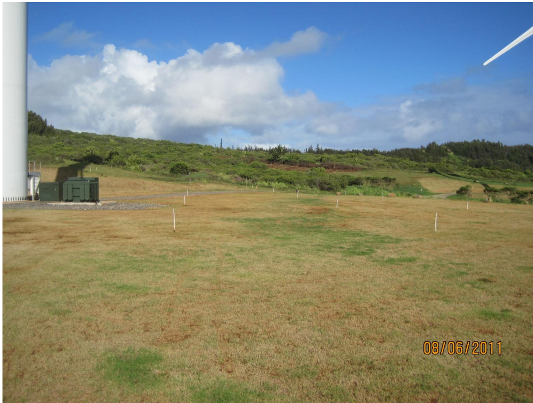
Figure 2. Transect marking stakes at KAH WTG 2. Staked rows are 14 meters apart.

We began the full search schedule of all turbines January 18, 2011. Appendix 1 shows search dates of the 50 % and 75 % search plots for each WTG and the MET tower during each quarter of FY 2012 and Table 1 shows the mean and standard deviation for search interval during FY 2012-Q1 and Q4 (the quarters when searching was accomplished 2 times per week in the 50% plots) and also for the search interval during FY 2012 Q2 and Q3 (the quarters when searches occurred 3 times a week in the 50% plots). The FY 2012-Q1 and Q4 50 % plot mean and standard deviation for search intervals were 3.51 (SD = 0.78) and for FY 2012-Q2 and Q3 were 2.52 (SD = 0.87), respectively. The FY 2012 75% plot mean and standard deviation for search intervals were and 13.95 (SD = 1.59) days.