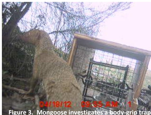
Figure 3. Mongoose investigates a body-grip trap.

Trapping for scavengers such as Mongoose and cat began in October 2011. Each plot was intensively trapped with 8 body-grip traps for a 2-3 week period then, as trap rate declined, reduced to 4-5 traps. Four live cat traps were moved around the site. Through June 30, 2012 we trapped a total of 250 Mongoose and 9 cats at all fatality monitoring plots (Figure 3).