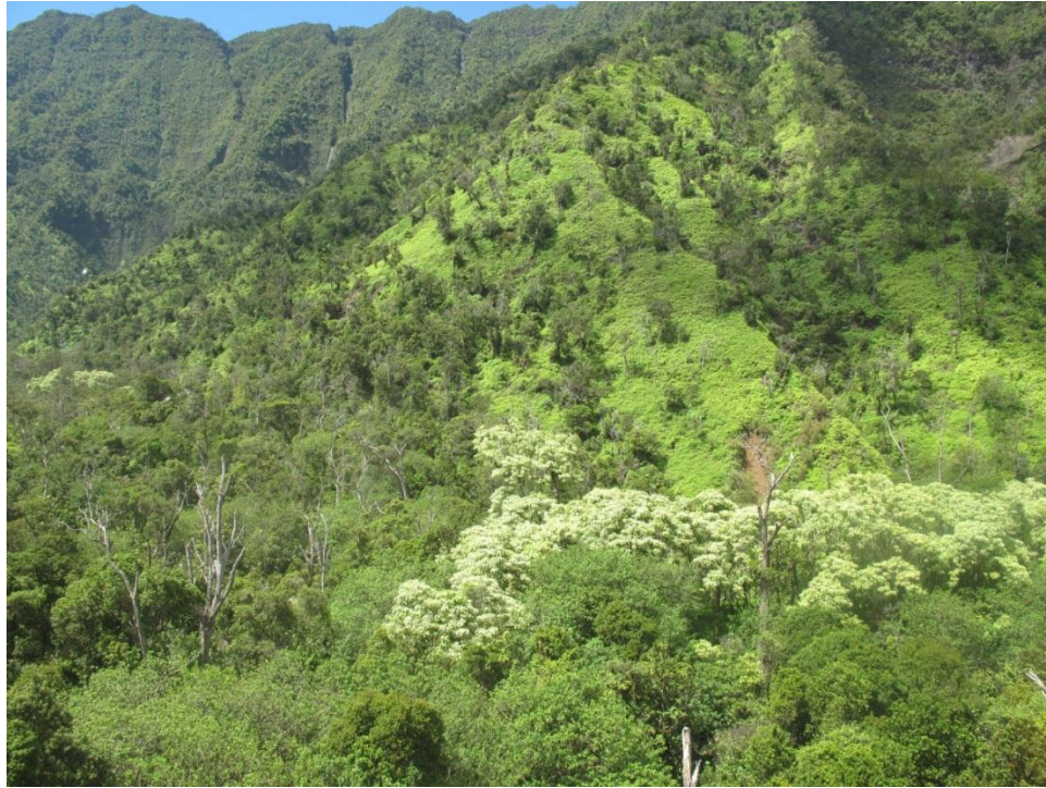
Figure 5. Slope in Wainiha Valley, Kauai where Newell's Shearwaters have historically been heard.