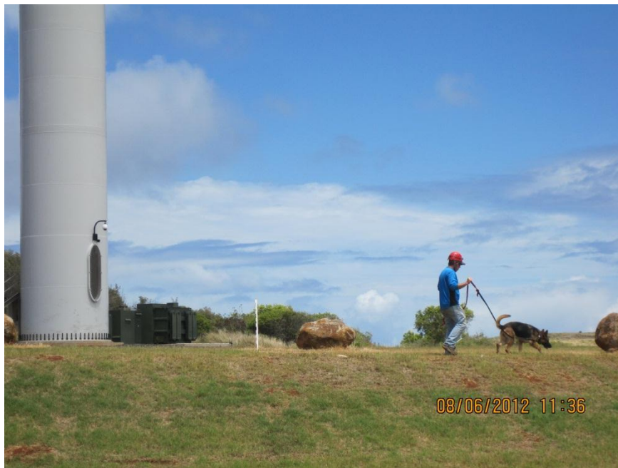
Figure 8. Matt Wickey training Honey to search for downed wildlife.

We recently began to train dogs to takeover fatality searching, reducing human effort and increasing our ability to find carcasses (Figure 8). We also began experimenting with new self-resetting scavenger traps for rats and Mongoose. We intend to experiment with grazing animals to reduce mowing time and costs and herbicide use.