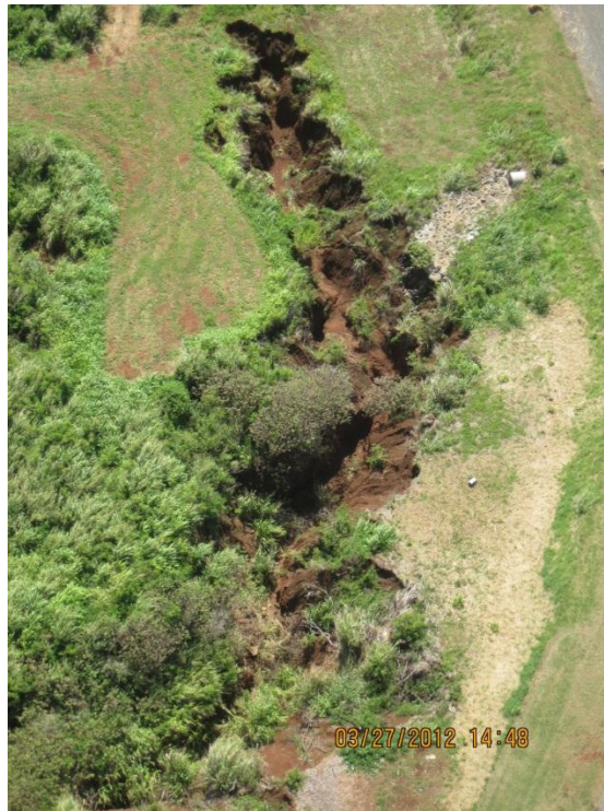
Figure 7. Kalaheokahipu Gulch near WTG 11 at KAH.