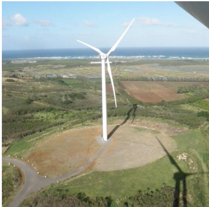
Figure 6. WTG 9- 75% fatality monitoring plot (On-pad=brown, Off-pad=green).

The HCP for KAH stipulates that the fatality monitoring plots around the WTG's and MET tower be mowed every month. Areas around the WTG's that are well-graded and flat (On-pad) are mowed every 2-3 weeks to 2.25 inches (Figure 6). Graded slopes that cannot be mowed are weed trimmed to 2-3 inches. Other areas outside the pads and graded slopes (Off-pad) are mowed with the turf-mower at 2.25 to 4 inches and /or brush cut-mowed with the Compact Track Loader to 2 to 5 inches every 3 to 6 weeks. Herbicides have also been used to retard growth.