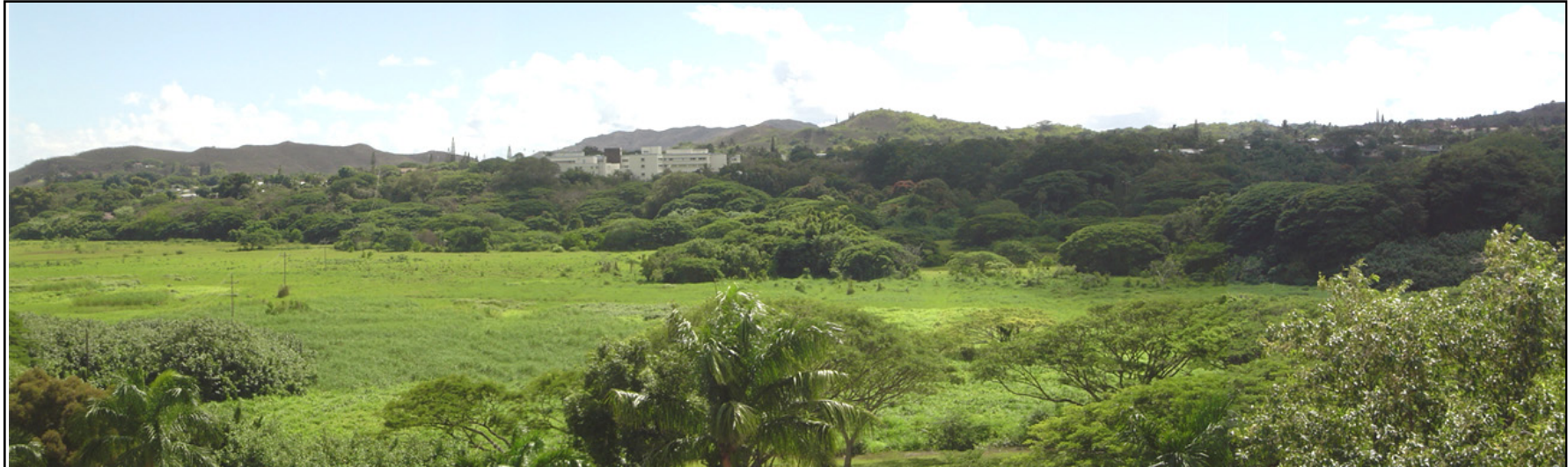
Exhibit 1 – Panoramic Photo of Kawainui Marsh Project Area

The marsh is located in the Kailua district of the island of O‘ahu, and generally bordered by major roadways on each side including Kalaniana‘ole Highway and Kailua Road, Mōkapu Saddle Road, Kapa‘a Quarry Road, and Kīhāpai Street. Figure 1.1 identifies the location of the project area and entire marsh boundary in relation to Kailua.