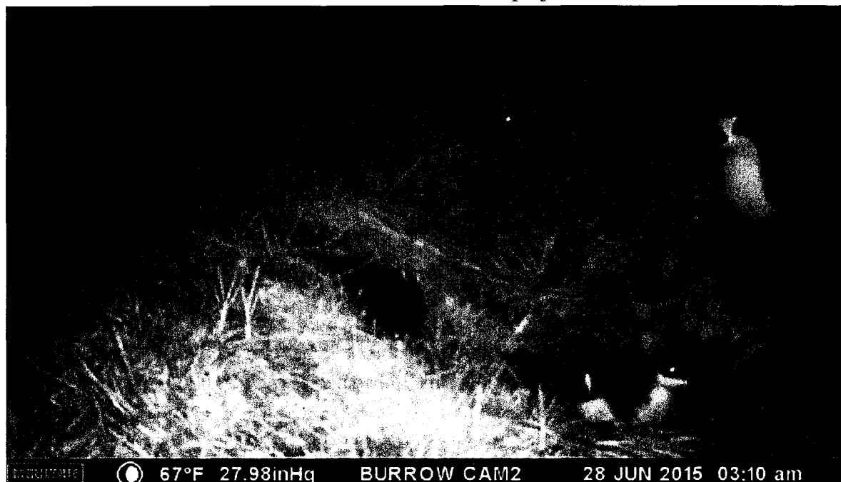
Newell's Shearwater on June 28, 2015 inside Enclosure B, below speakers and next to burrow entrance.

the Bulwer's petrel that was documented visiting the enclosures in FY 2014, is promising. This social attraction project is the first of its kind in Hawai'i and will serve to inform future seabird protection efforts worldwide. DOFAW continues to work closely in partnership with SunEdison staff and contractors to ensure the future success of the project.