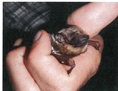
Female Hawaiian Hoary Bat caught at U'koa Wetland, Oahu.

Hawaiian Hoary Bat. The Tier 1 mitigation effort proposed in the HCP to offset the requested take of 20 bats included 80 acres of wetland restoration and 40 acres of upland restoration at U'koa Pond on the North Shore of O'ahu. This effort was proposed in conjunction with mitigation to offset take of waterbirds. Work began at U'koa in April of 2012, beginning with baseline bat acoustic monitoring that is ongoing. Since that time, a 3-mile long ungulate-proof fence has been constructed around the mitigation site and predator control (ungulate