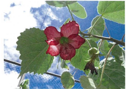
Ko'olua'ula (Abutilon menziesii), Island of O'ahu.

Take Authorization: All plant individuals of Abutilon menziesii within the 1,381-acre project area.