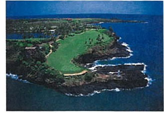
Kaua'i Lagoons, Kaua'i.

ITL Duration: April 11, 2012 – April 11, 2042