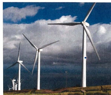
Kaheawa Wind Power project in West Maui above Ma‘alaea.