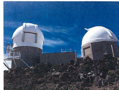
DKIST Facility on Haleakalā summit.

Project: Construction of the Daniel K. Inouye Solar Telescope (DKIST) within the 18-acre University of Hawai‘i Institute for Astronomy Haleakalā High Altitude Observatory site at the summit of Haleakalā.