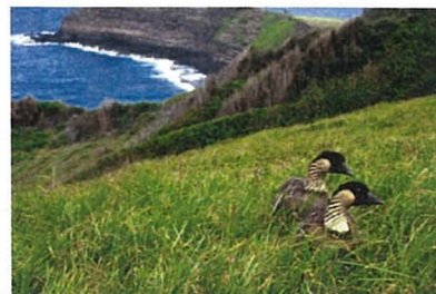
Nēnē, official bird of the State of Hawai'i, resting in the foreground.

Observations from surveys throughout the reporting period resulted in a total of 54 banded birds and six unknown birds were seen. Annual data and survey observations indicate an estimated population of 78 individual Nēnē, including those from the original translocation efforts.