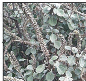
Achyranthes splendens var. rotundata .

ITL Duration: February 10, 2014 – February 9, 2024