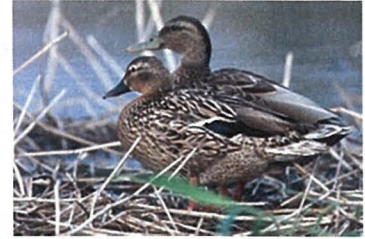
Koloa Maoli or Hawaiian Duck, endemic to the Hawaiian Islands.