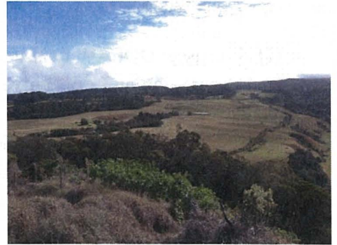
Pi‘iholo Ranch on Maui.

Take Authorization: Incidental take of Nēnē on lands owned or otherwise controlled by Pi‘iholo Ranch, LLC.