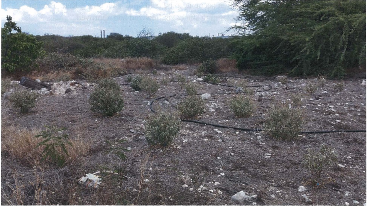
Plot 1 outplants on 6/25/2015

A total of 155 plants were installed in four plots within the Kalaeloa Unit in December 2014 (see example, Plot 1). In April 2015, at the end of the establishment period, 148 plants were living. Plants received supplemental water to reduce drought stress during hot and dry summer months. Minimal hand-clearing of weeds was needed to maintain a 2-foot buffer around each plant. Mealy bugs were treated as needed. All year-one success criteria have been met: there are at least 120 living plants (139) and there are no mature kiawe ( Prosopis pallida ) within the four plots.