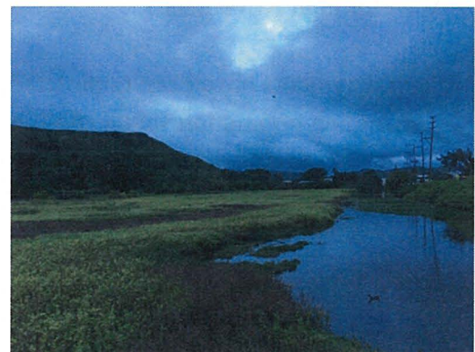
'Alae 'Ula or Hawaiian Moorhen swimming at Hamakua Marsh

Hawaiian Petrel & Newell's Shearwater. In accordance with the Kahuku Wind HCP, the seabird mitigation plan for Newell's Shearwater and Hawaiian Petrel requires SunEdison to fund seabird colony-based protection and management measures on the island of Kaua'i. Staff from the DOFAW Kaua'i Endangered Seabird Recovery Project (KESRP) identified six sites to implement Barn Owl control as a form of seabird colony protection. DOFAW began to implement work in the fourth quarter of FY 2015 at the six sites: (1) Nualolo Aina; (2) Nualolo Kai; (3) Honopu; (4) Kalaheo/Kahili; (5) Lehua Islet; and (6) the back of Hanalei Valley. It is expected that these six areas hold significant potential for shearwater conservation through barn owl-specific predator control actions.