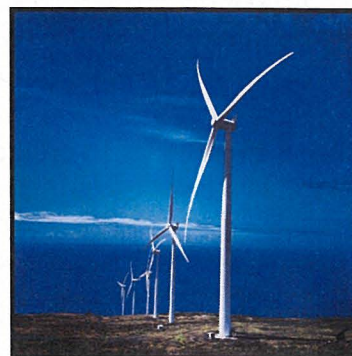
Auwahi Wind Power, Maui

ITL Duration: February 9, 2012 – February 9, 2037