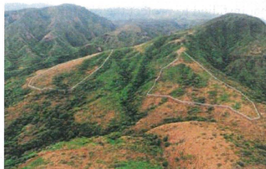
Enclosures A & B at the Makamaka'ole seabird mitigation site, West Maui.

Hawaiian Petrel and Newell's Shearwater. In addition to seabird mitigation activities underway in conjunction with KWP I at Makamaka'ole (see page 6), in the unlikely event that the initial five year mitigation targets at Makamaka'ole for seabirds are not met, KWP II is also required by the HCP to conduct surveys consisting of 14 to 20 survey nights, at two sites on West Maui where in-situ colony protection might be feasible. Site surveys were initiated at Kahakuloa, Maui in June 2012, but due to terrain and other access challenges, it was determined that the area was not desirable for in-situ conservation work. The