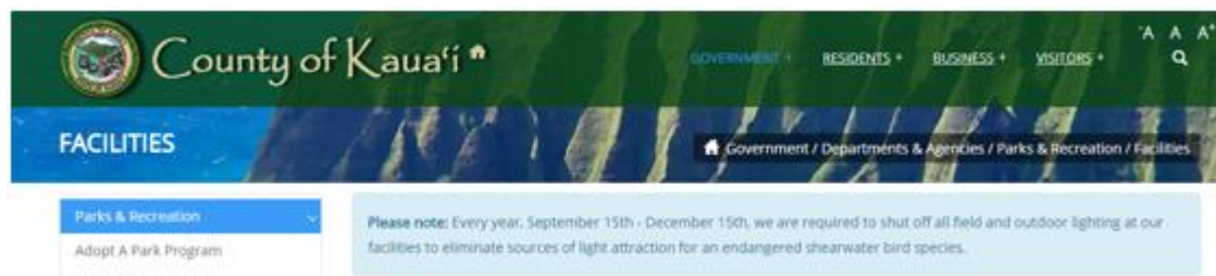
Figure 2. Department of Parks and Recreation Website Notice