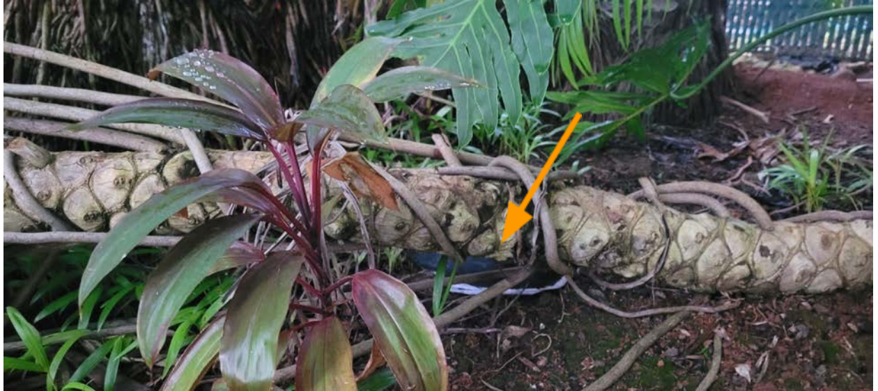
#13 - Not Reported - Open