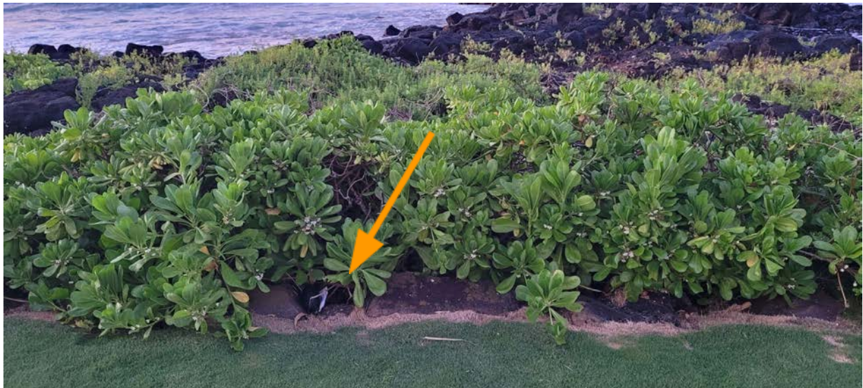
#5 - Reported - Cover, Partial