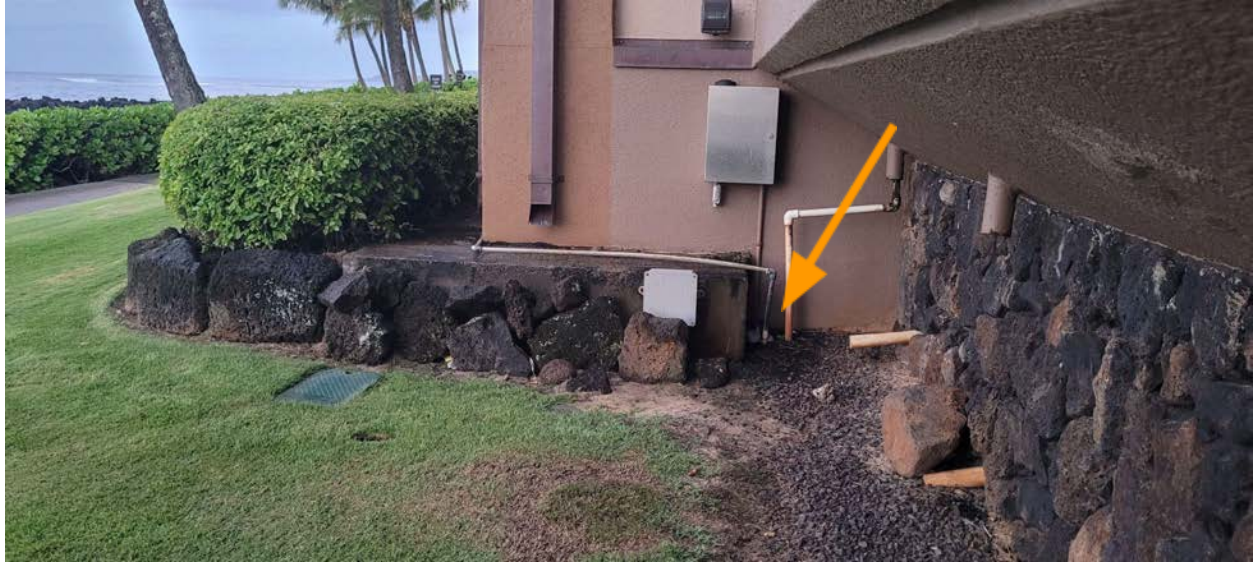
#12 - Not Reported - Open