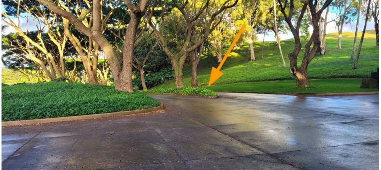
#8 - Reported - Open