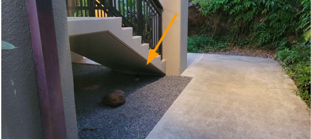
*Decoy in morning lighting.