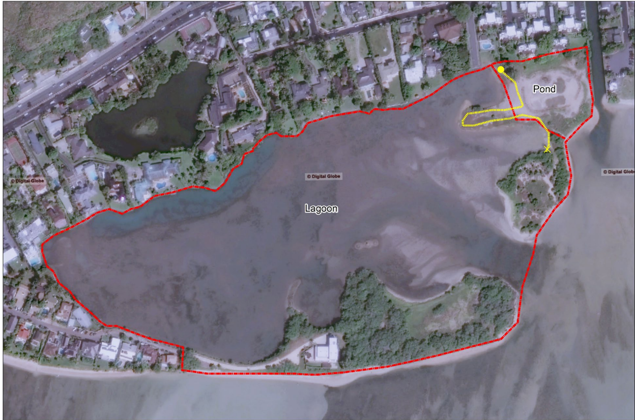
Figure 1. Map of Pond and Lagoon at Paikō Lagoon State Wildlife Sanctuary on O'ahu, Hawai'i, USA. The solid yellow dot marks the start of the survey and follows along the yellow dotted line and ends at the yellow x.