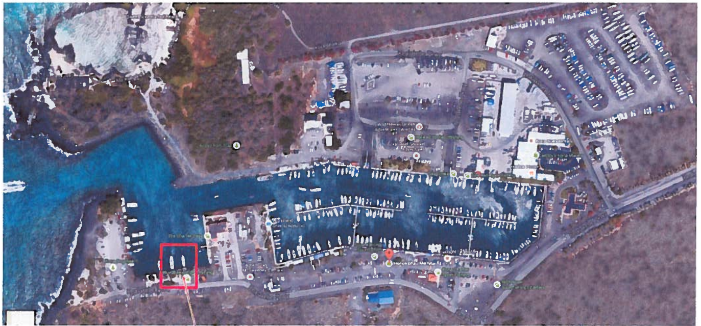
Approximate location of RP area