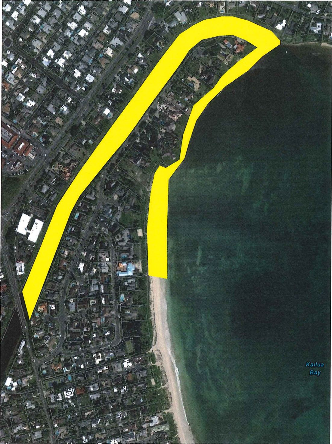
TMK (1) 4-3-022:Seaward and Portions of 002, (1) 4-3-083:Seaward of 003, 004, 008 to 010.