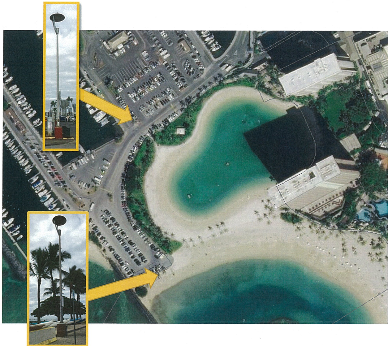
TMK (1) 2-3-037: portions of 012