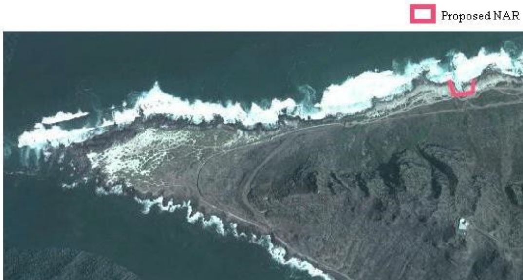
Aerial View of Proposed NAR Extension at Ka`ena Point