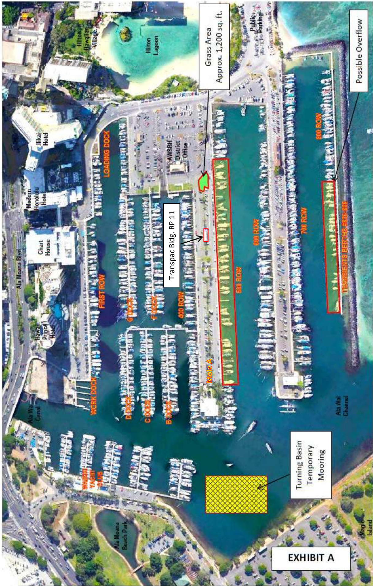
Ala Wai Small Boat Harbor 1651 Ala Moana Blvd.