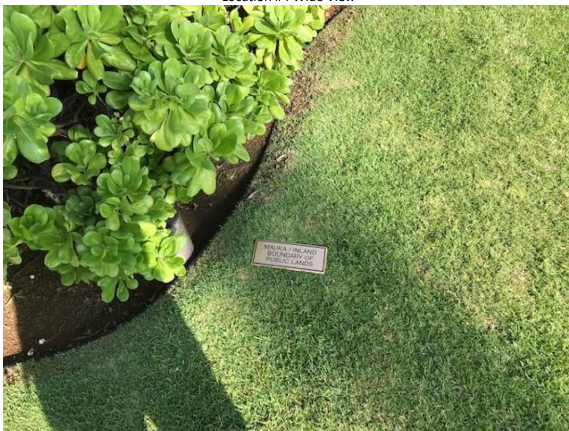
Location #4 Close Up