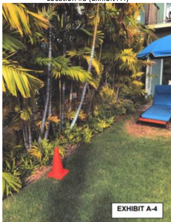
Location #3 Wide View