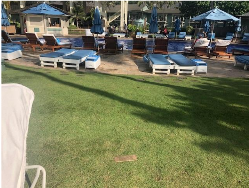
Location #3 Close Up