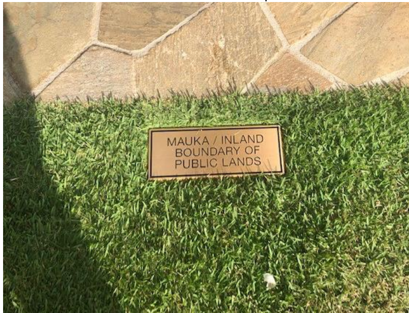
Location #2 (Exhibit A3)