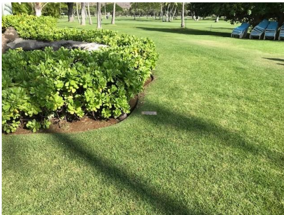
Location #4 Wide View