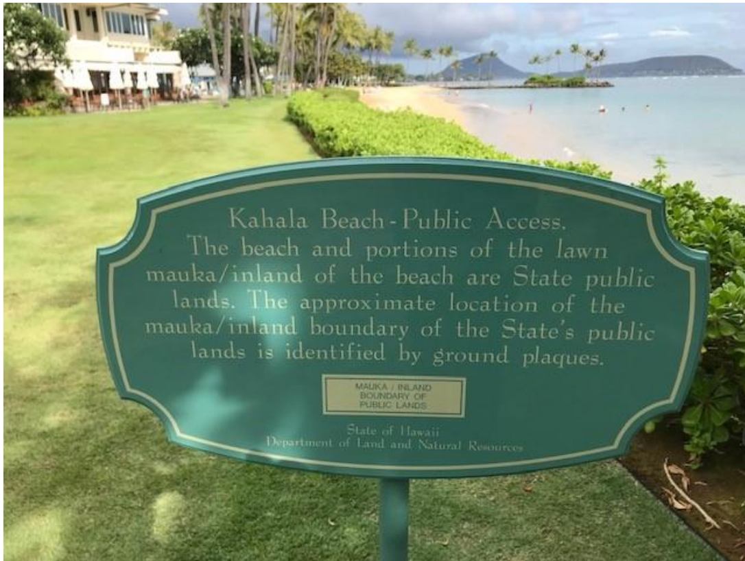
Entry to from Diamond Head Side of Resort