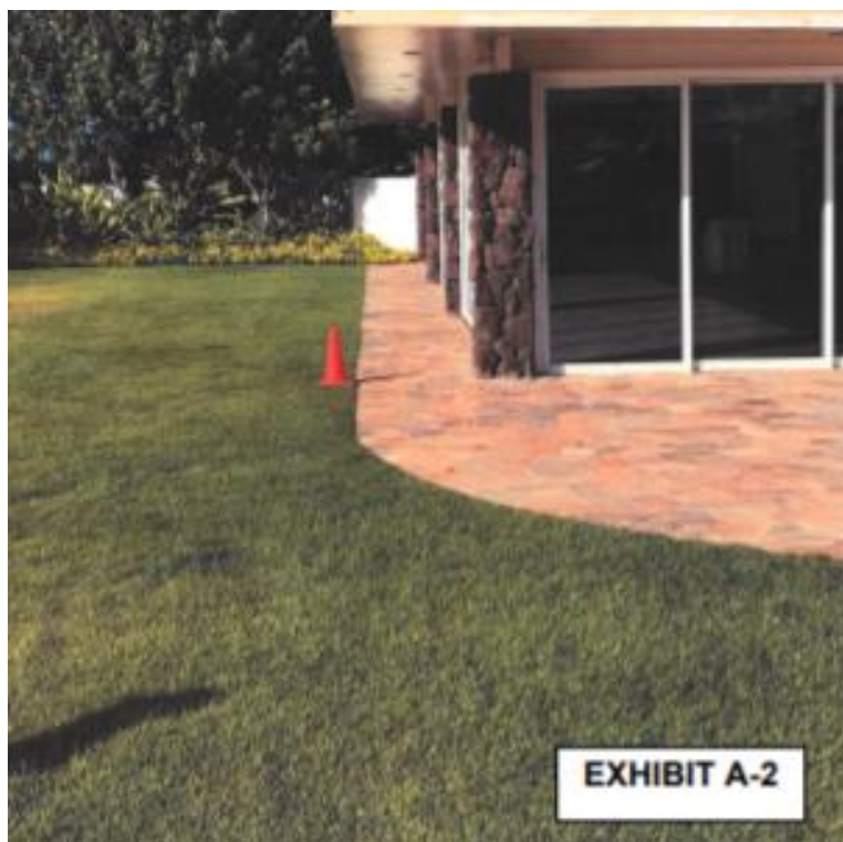
Location #1 Wide View