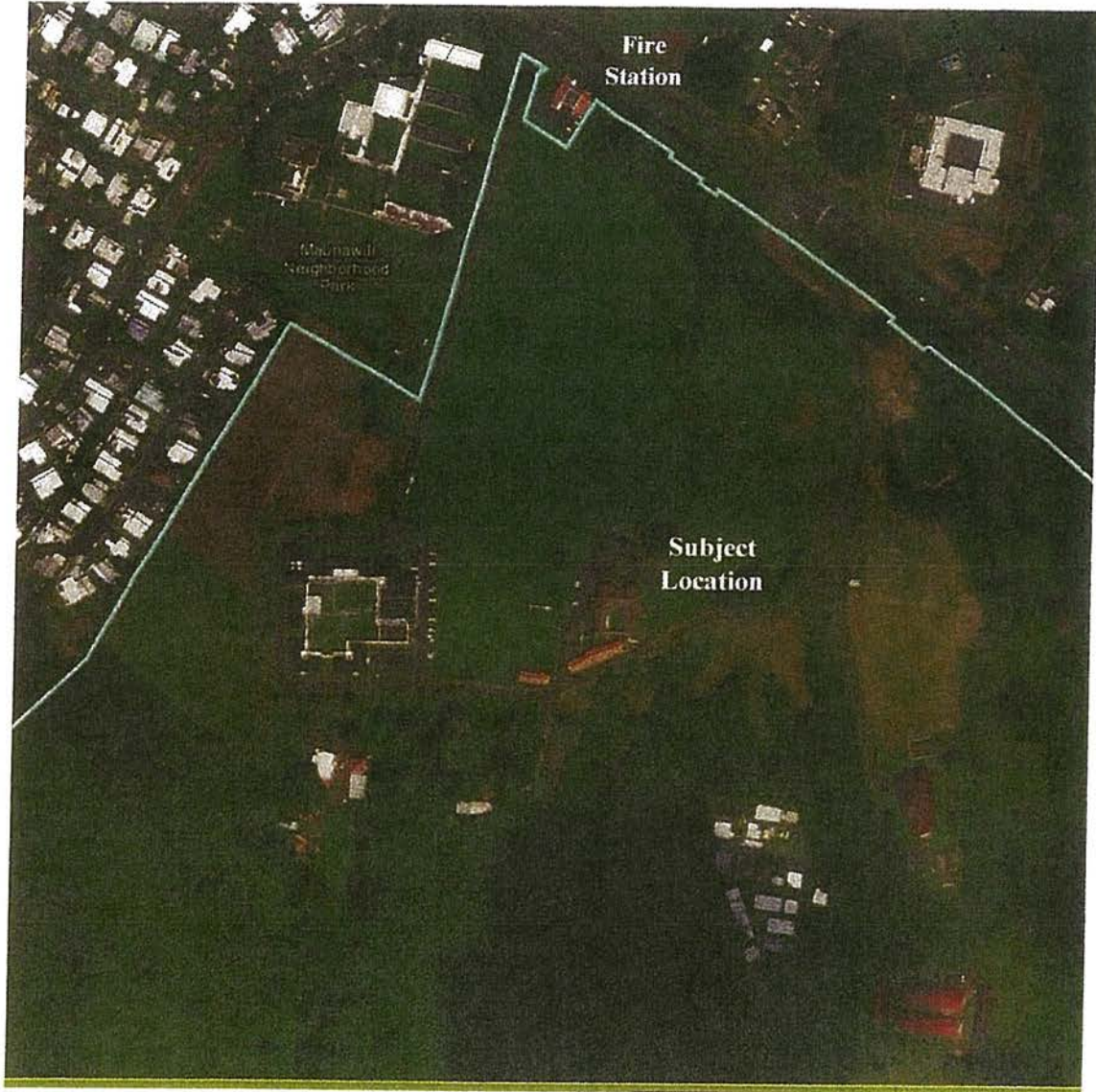
TMK (1) 4-2-006: portion of 002