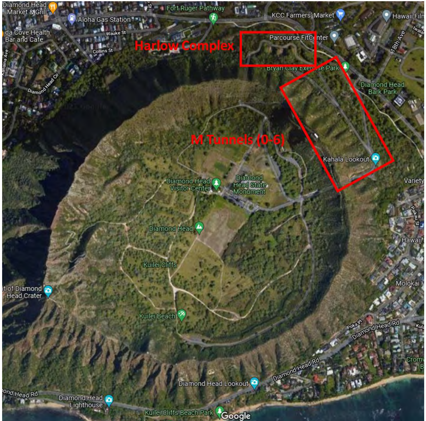
(1) 3-1-042: portions of 006