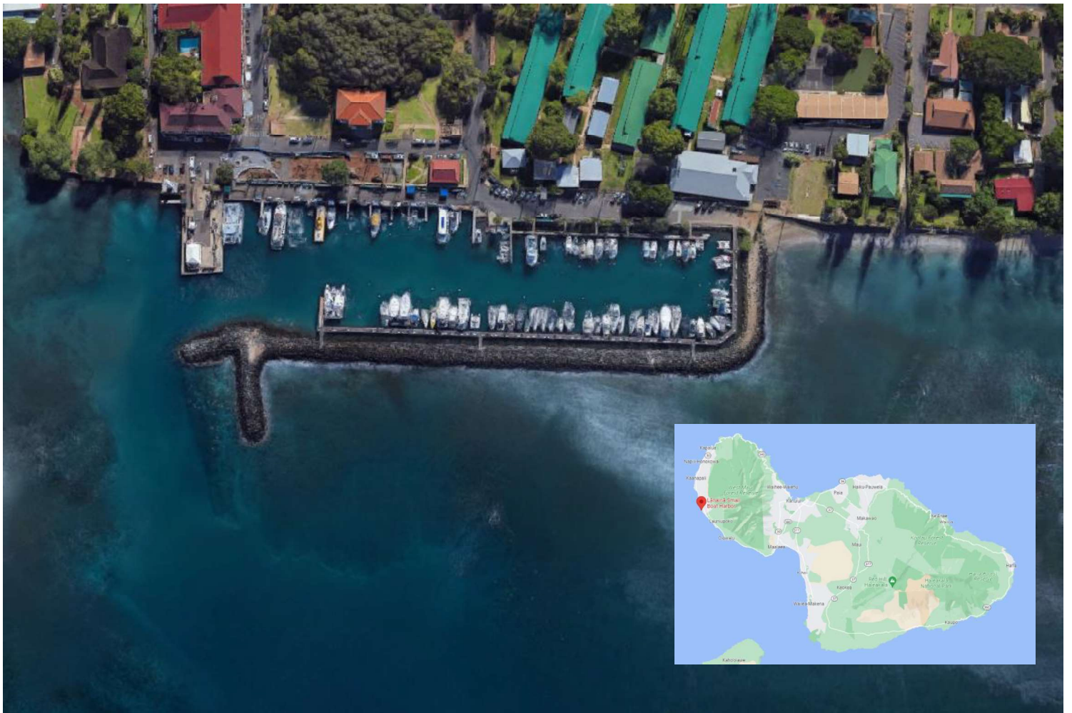
Exhibit A-1 Lahaina Small Boat Harbor