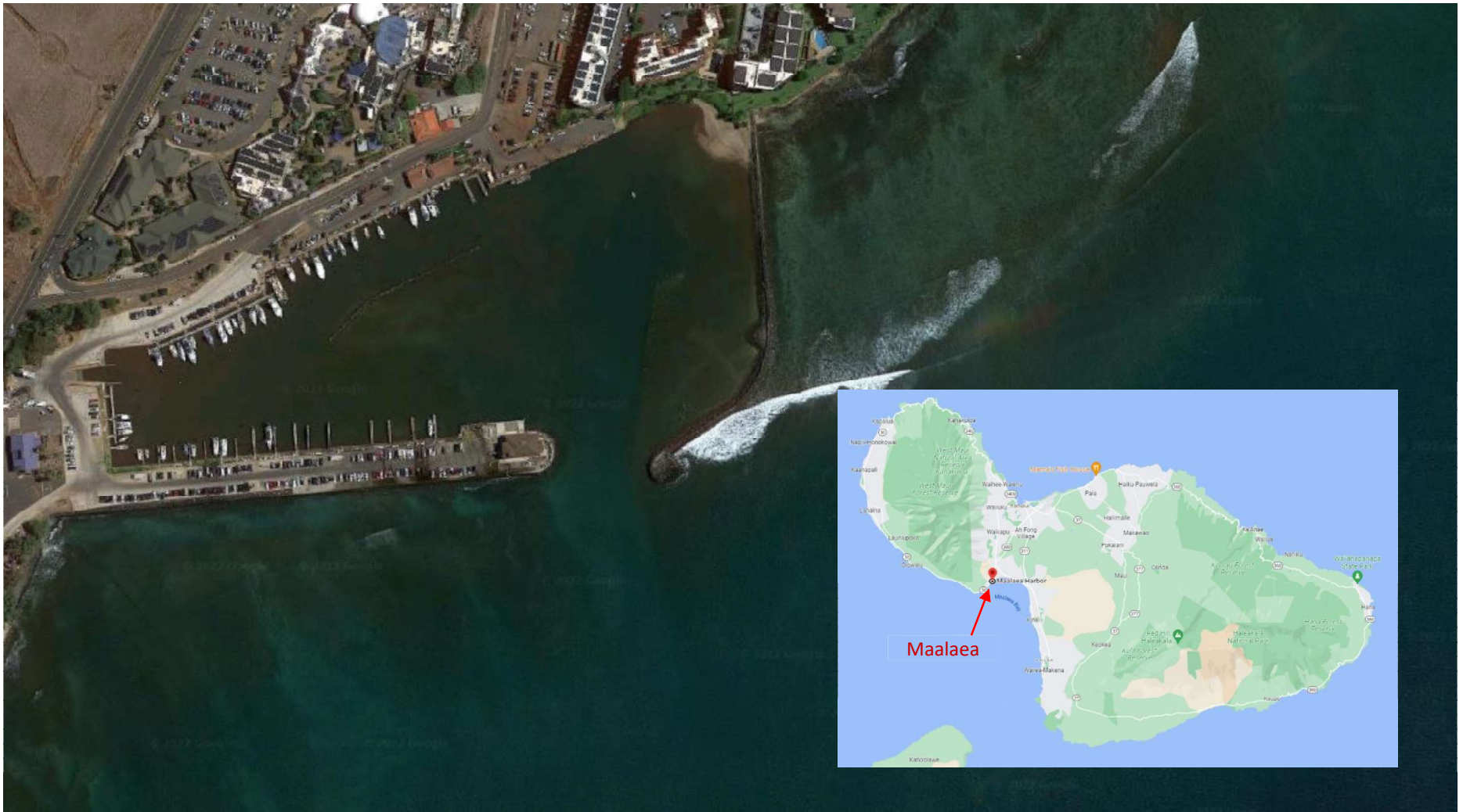
Exhibit A-1 Maalaea Small Boat Harbor