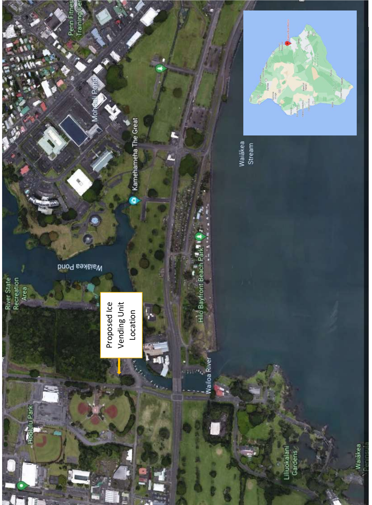
Exhibit A-1 Wailoa Small Boat Harbor