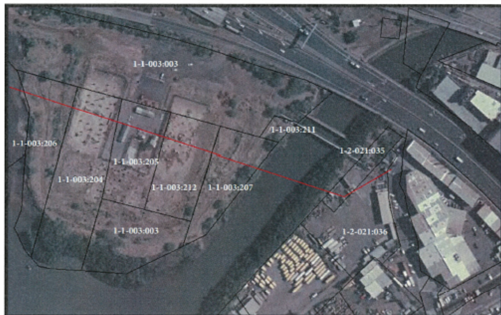
TMK: (1) 1-1-03:03, 04, 138, 204, 205, 206, 207, 212, 239; (1) 1-2-21:35, 36, 37 portion