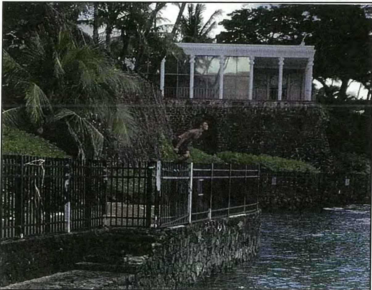
Note: Unsafe public behavior. TMK: (1) 3-1-041:seaward of 005