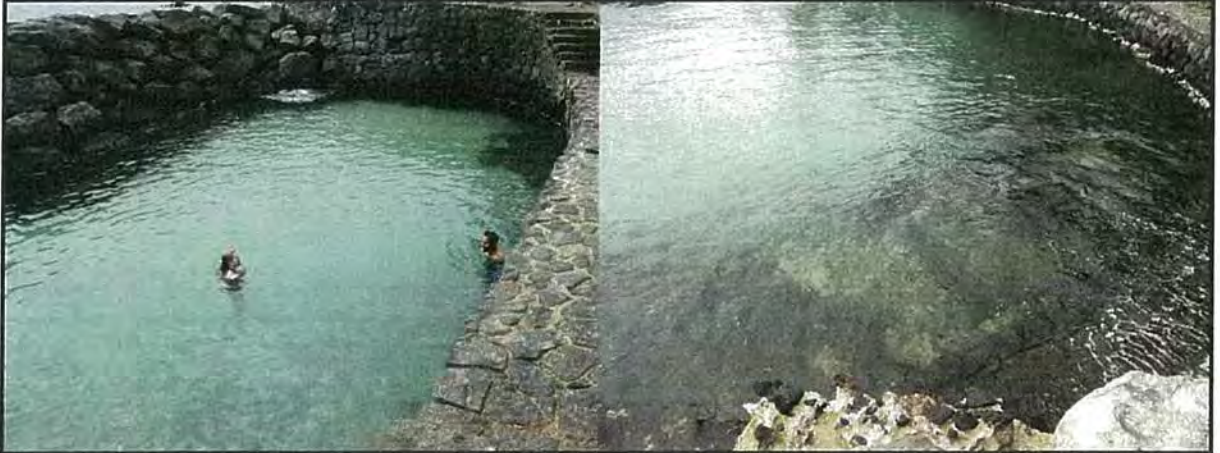
Note: Views of boat basin being used by the public. TMK: (1) 3-1-041:seaward of 005.