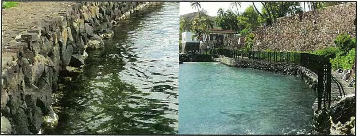
Note: Views of the seawall. TMK: (1) 3-1-041:seaward of 005.