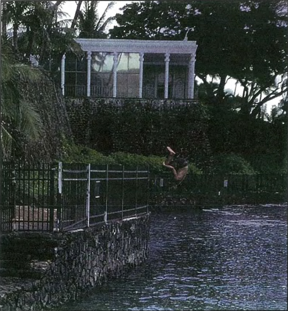
Note: Unsafe public behavior. TMK: (1) 3-1-041:seaward of 005.