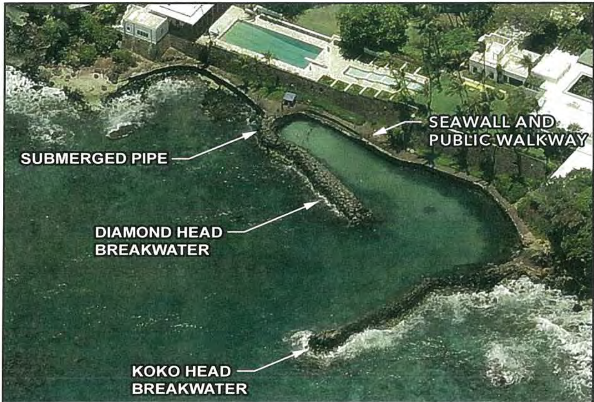
Note: Aerial view of boat basin and Diamond Head breakwater. TMK: (1) 3-1-041:seaward of 005.