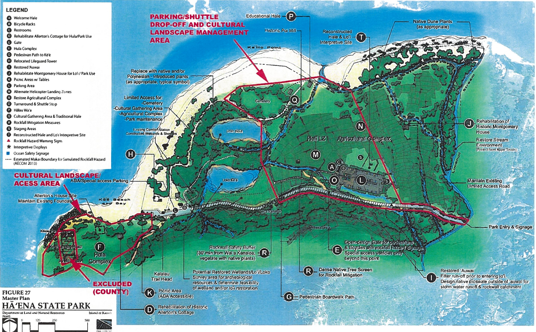
FIGURE 27 Master Plan HĀ'ENA STATE PARK Department of Land and Natural Resources North Island of Kauai Scale: 0, 125, 250, 500 PWA 11553 011 01/15/11

Source: Based on 2001 Community Preferred Master Plan Prepared by The Keith Companies Disclaimer: This Graphic has been prepared for general Planning purposes only and should not be used for boundary interpretations or other spatial analysis.