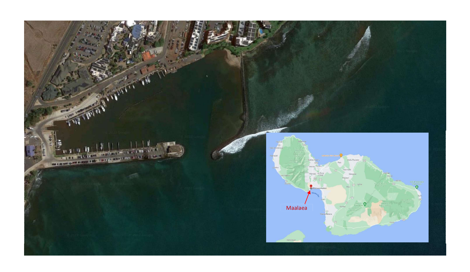
Exhibit A-1 Maalaea Small Boat Harbor