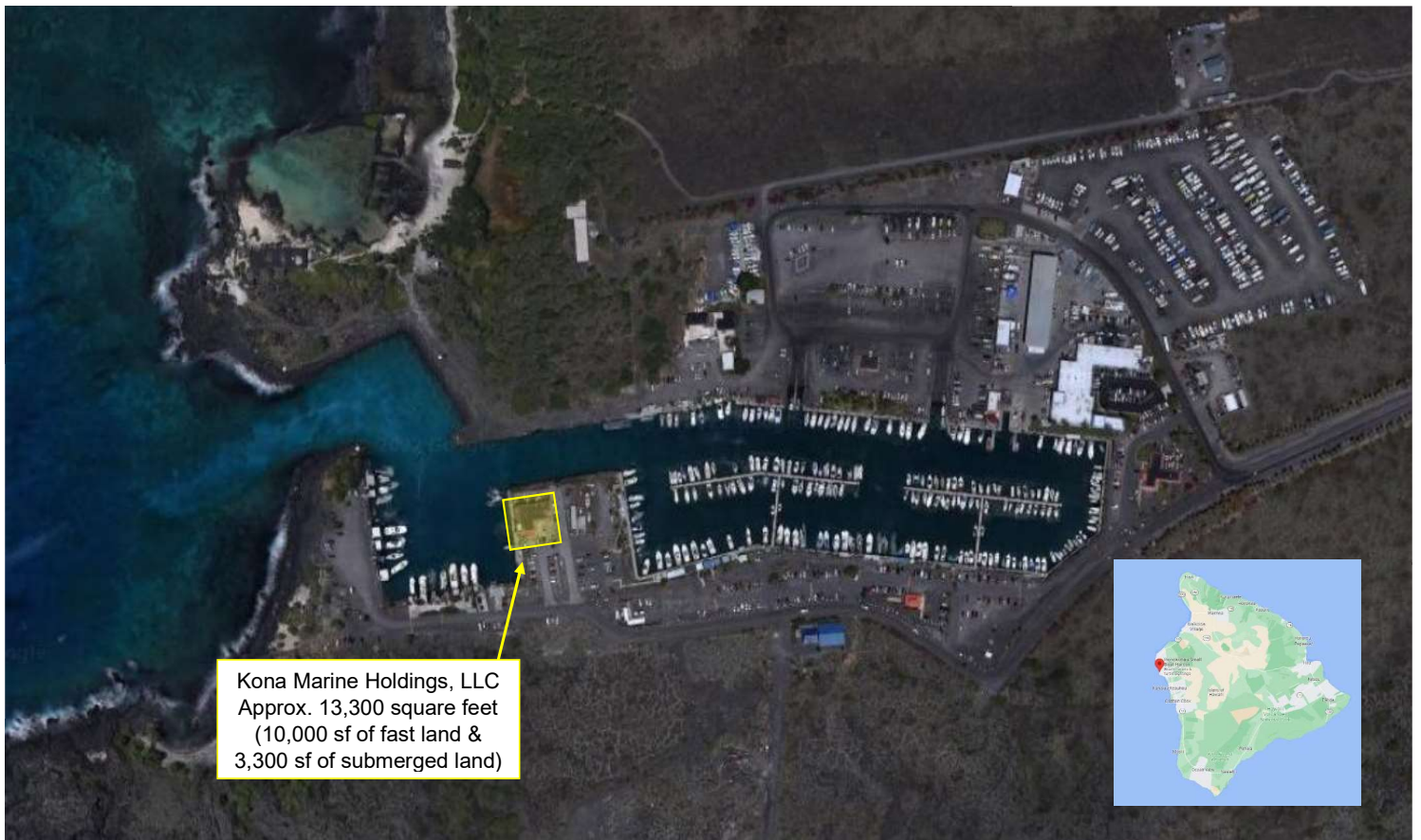
Exhibit A Site Location Honokohau Small Boat Harbor, Hawaii Island