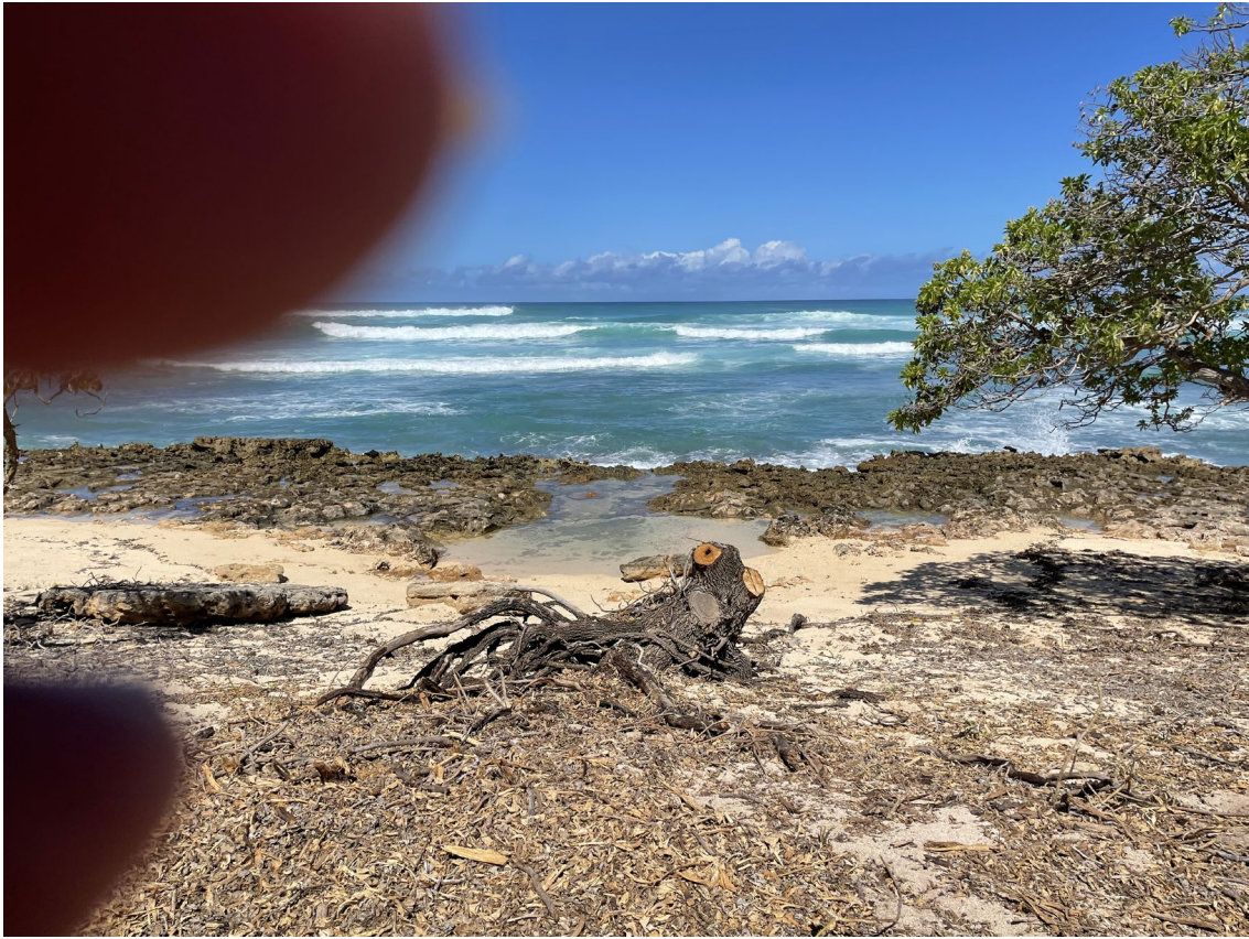
October 17, 2023 Work upon submerged land