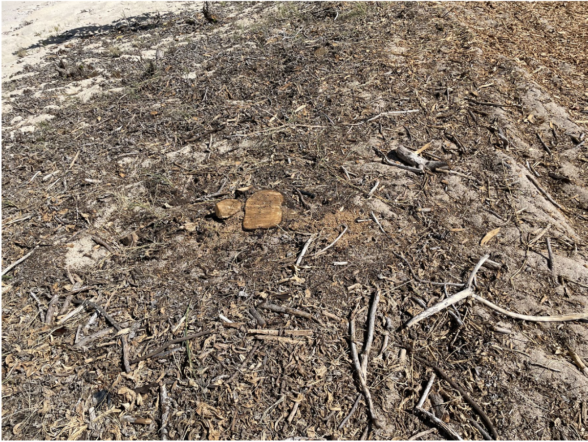
October 17, 2023 Clear cut tree above; Fence line #2 below