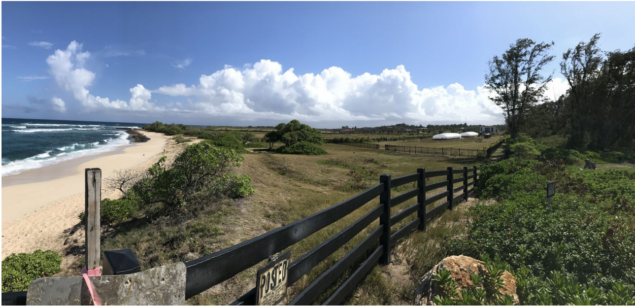
November 18, 2022