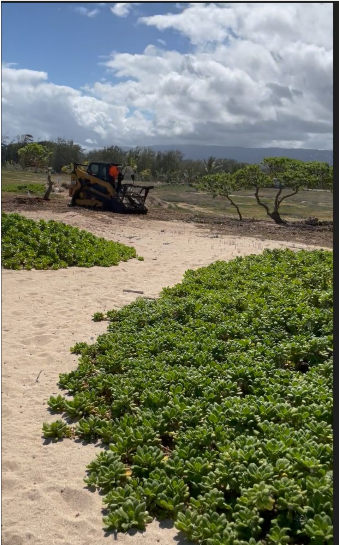
October 17, 2023 Work taking place in the Conservation District. EXHIBIT B