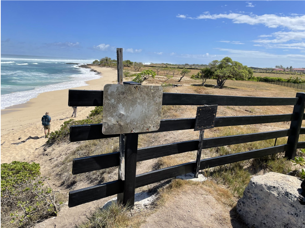
October 17, 2023