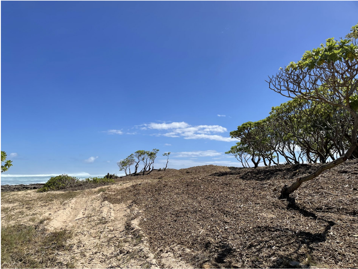
October 17, 2023 Mulch everywhere