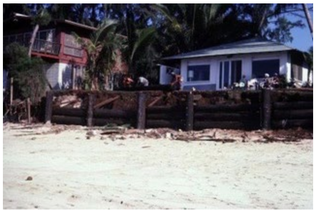
1977 Illegal seawall installation (brown house is Freemans)