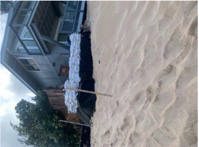
11/10/2022 Initial Freeman sandbag installation (above) 1/30/2023 Install of sandbag groin (below)