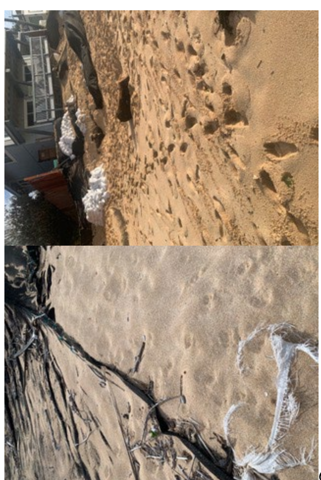
6 month old sandbag.